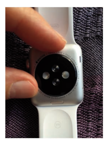
The back of the Apple Watch has four sensors, which include infrared and visible-light LEDs, in addition to photosensors.

It's important to step back from the questions of usefulness, affordability, and style, etc., and ask a much more basic question: is it safe?