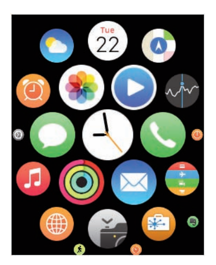
The Apple Watch app screen

Granted, from a usability perspective, this first generation Apple Watch does have its share of challenges, as reviewers have been quick to point out. These include inconsistencies in the different types of notifications, favoring recall over recognition on some of the functions, small targets on the screen, and perhaps, in general, focusing a bit more on the industrial design at the expense of the overall user experience. No need for me to rehash the reviews. Also, my comments here are not given to pass judgment, but rather as a way to help others learn more about design from both a user and ecosystem perspective.