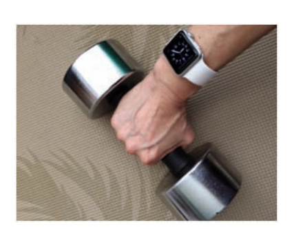
Fitness tracking is a big part of the appeal of the Apple Watch.

Without a doubt, the biggest challenge I see for the Apple Watch is the pressure to include a camera in a future release. It's possible that privacy concerns about