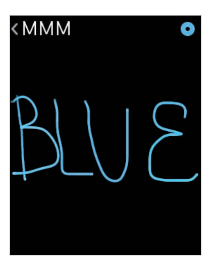
The Doodle screen on the Apple Watch could possibly be used for a single-stroke shorthand writing recognition system like Graffiti.

And speaking of Siri, it's great that this natural language user interface is included on the Apple Watch. You need a very simple way to interact with the Watch, especially given the small form factor. "Hey Siri" seems to work fine for most short typical requests. Once or twice, with longer and more complex audio dictation during my testing, I had to repeat and try it all again from the beginning. But on the whole, Siri works very smoothly and accurately.