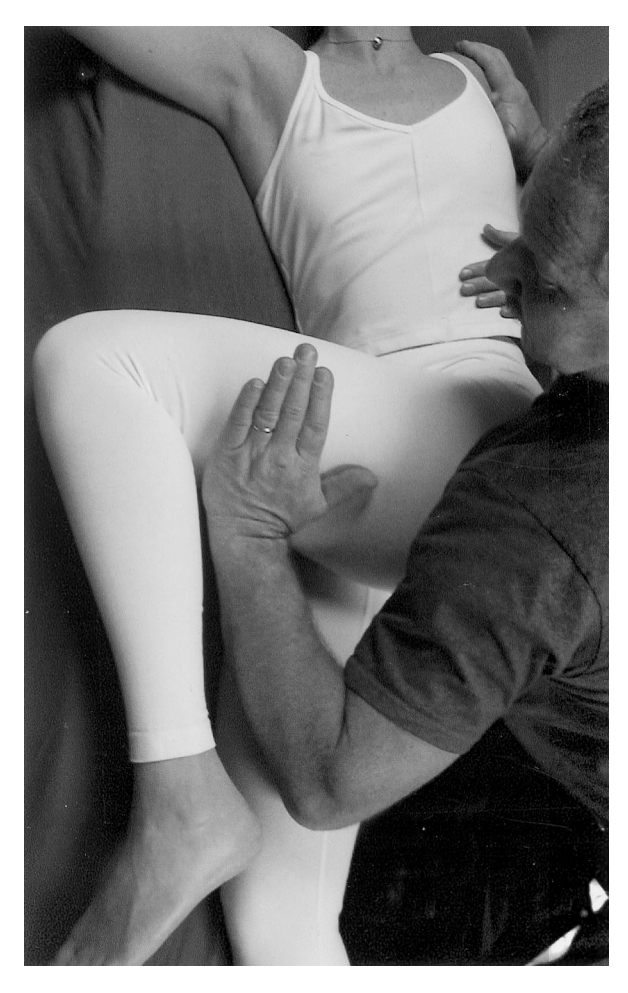
FIG. 6. Improved range of motion.

Improved mobility in joints where a degeneration process is present