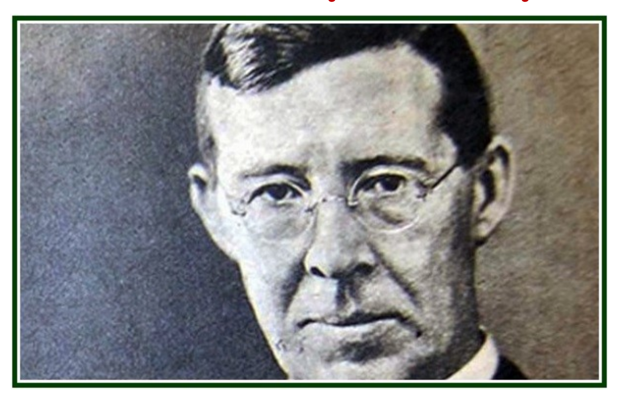
Sorokin wrote his books from the point of view of universal compassion