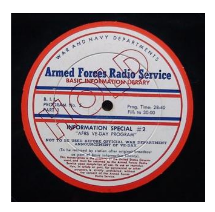
An AFRS 16 inch transcription disc - the May 1945 V-E Day "Special Program"