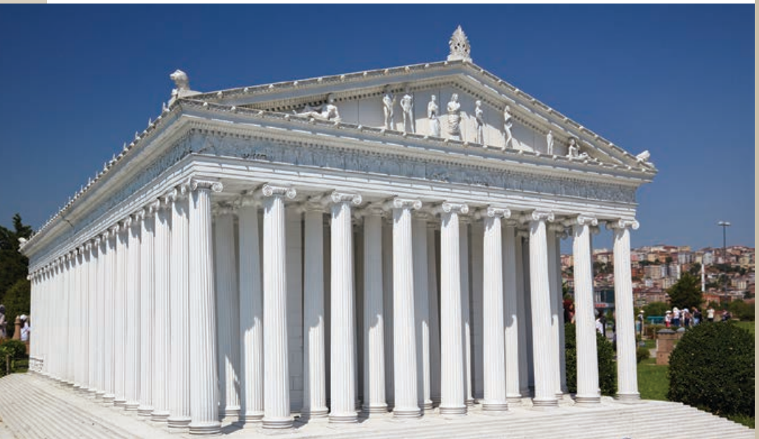
Model Reconstruction of the Temple of Artemis

Ephesus was a major port city of the Roman Empire. The city was also the center of the worship of Artemis (the Roman goddess Diana), the goddess of hunting and fertility. Devotees of Artemis built a large ornate temple in her honor there. Life in Ephesus largely revolved around this temple and its religious activities. Thousands of priests maintained a well-organized temple bureaucracy. Businessmen and artisans made money by selling silver idols of Artemis and related souvenirs to visitors.