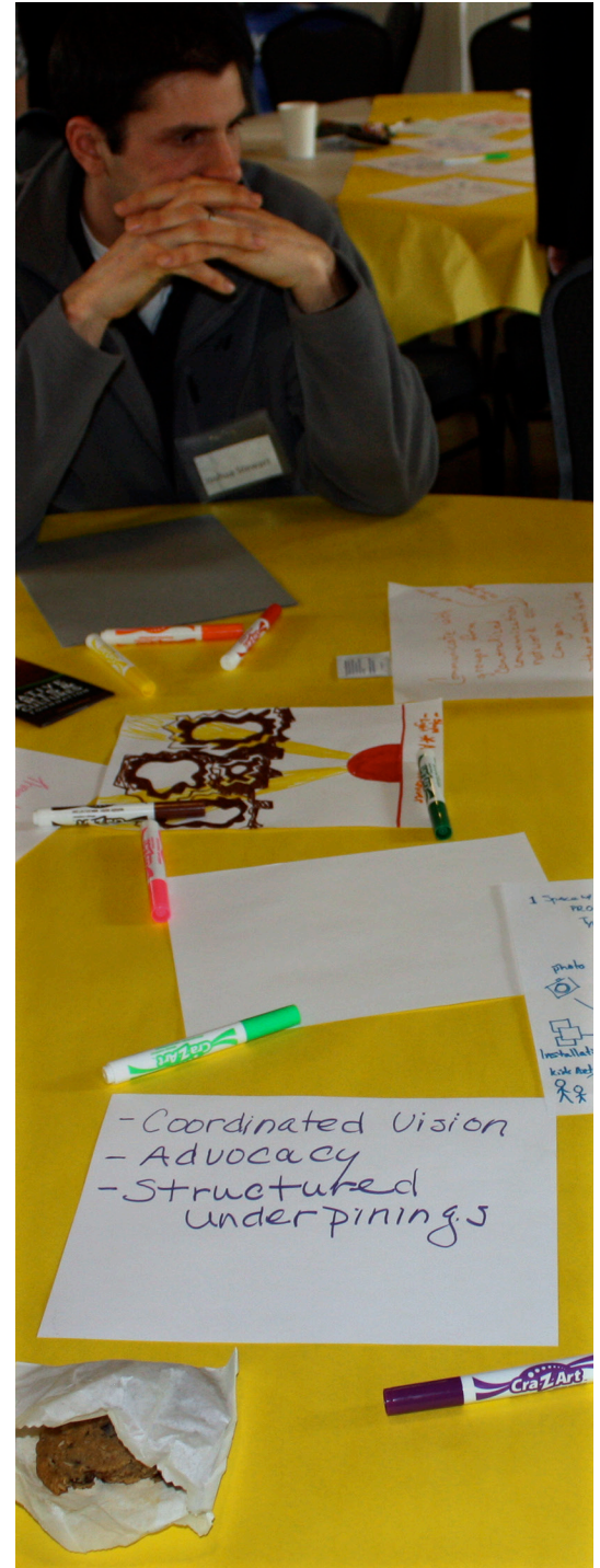
Brainstorming at the Summit.

It was clear we needed more information to support our vision for a vital arts community in Clark County. Arts of Clark County, a nonprofit organization and the Clark County Arts Commission formed a partnership to apply for the Creative Vitality Index grant offered by ArtsWA (Washington State Arts Commission) and Art Works.(National Endowment for the Arts). This successful grant application gave us access to local financial data which allowed us to understand the value and contribution of our creative economy in a more tangible way.