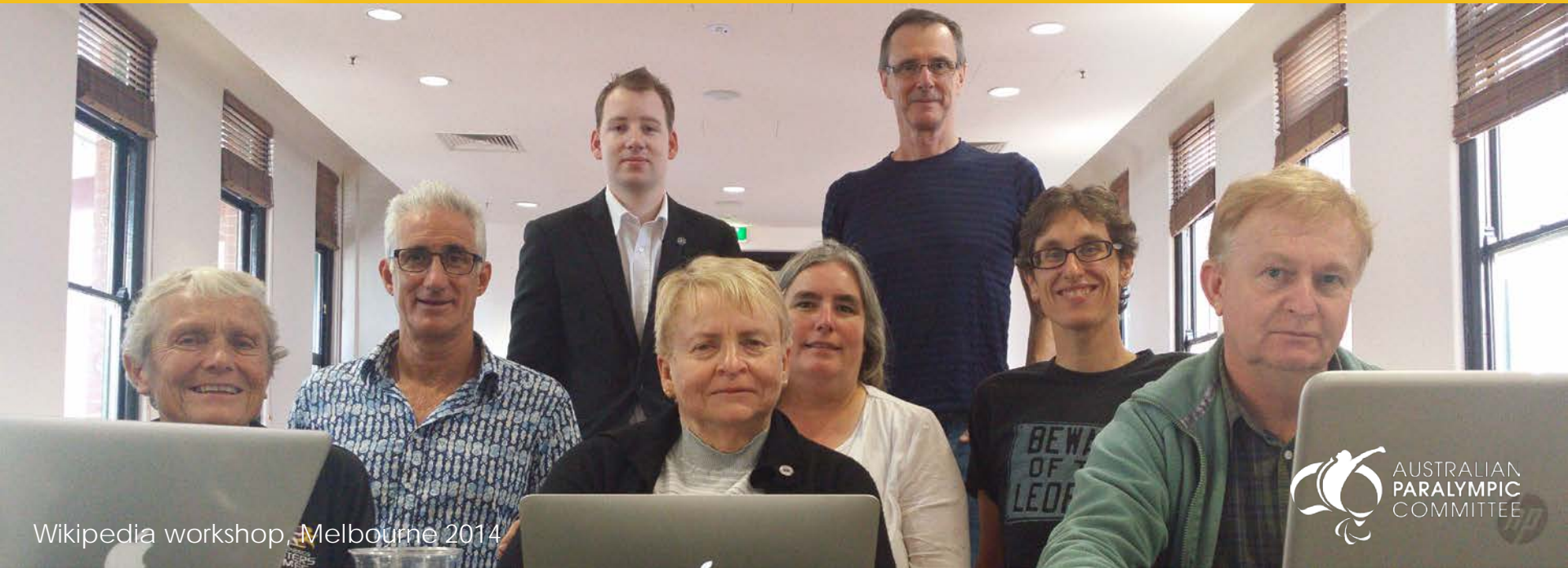
Wikipedia workshop, Melbourne 2014

The broader community is touched by Paralympic sport and wants to contribute.