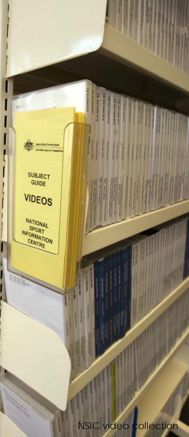
NSIC video collection