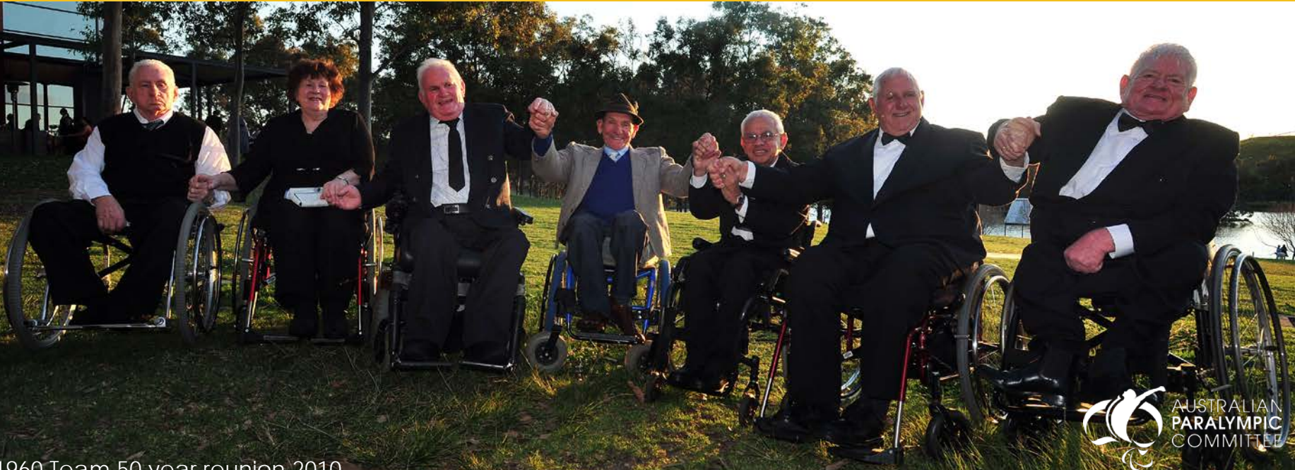
1960 Team 50 year reunion 2010

Following the reunions held so far, the APC has also benefitted from donations of objects, loans of scrapbooks and photos, and contributions to the oral history project.