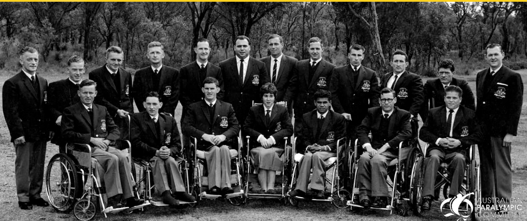
1960 Team pre-departure

A project to capture, manage and preserve the history of the Paralympic movement in Australia in a way that is relevant and accessible and places the Paralympic movement within its broader social context.