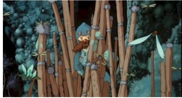
A scene from Nausicäa of the Valley of the Wind

Miyazaki’s films are also striking for their preoccupation with the environment, and their not entirely metaphorical suggestion that the natural world is capable of remembering what’s been done to it. (He believes that we harbor “memories in our DNA from before we took the form of humans.”) “ Nausicäa of the Valley of the Wind ” (1984) is set in a post-apocalyptic world where humans live huddled on the edge of a toxic forest. Its heroine finds beauty in the lush, strangely colored undergrowth and the giant cicada-like insects that dwell there, nursing a grudge against the humans who’ve poisoned their habitat.