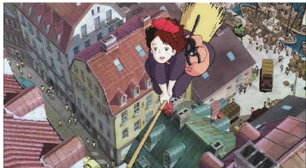
A scene from Kiki's Delivery Service

Toshio Suzuki, a wry, articulate man with close-cropped silver hair and an elfin grin, is Miyazaki's producer and longtime collaborator. "When silents moved to talkies, Chaplin held out the longest," he told me. "When black-and-white went to color, Kurosawa held out the longest. Miyazaki feels he should be the one to hold out the longest when it comes to computer animation." Miyazaki lavishes particular attention on his backgrounds, which are full of painterly flourishes. I'd never really noticed the colors in an animated film until I noticed his. Skies and seas are saturated in strangely emotional blues; wet halos surround the red lantern and absinthe-green neon signs in "Spirited Away"; in "Kiki's Delivery Service," the young witch's dress isn't quite black—it's the smudged purple of the darkest plums.