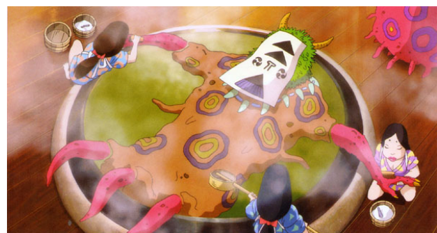
A scene from Spirited Away

Miyazaki began his animation career in the nineteen-sixties, at a time when the economic miracle that had swiftly transformed postwar Japan into one of the strongest economies of the world was, almost as swiftly, obliterating its countryside. In the nineteen-eighties, the government cleaned up the worst industrial pollution, but Japan is still a country where developers (especially golf-resort planners) have free rein, where most people prefer nature in tamed and miniaturized form (bonsai, Zen gardens, lavishly packaged tiny melons), and where few places are untouched by commerce (there are vending machines on Mt. Fuji). “ Spirited Away ” contains a memorable scene in which a gloppy-looking creature—the spirit of a polluted river—comes to a bathhouse to be cleansed; a lot of dirty, foul-smelling labor is required. For this sequence, Miyazaki drew on his own memories of cleaning up a river—and pulling things like bicycles out of the muck.