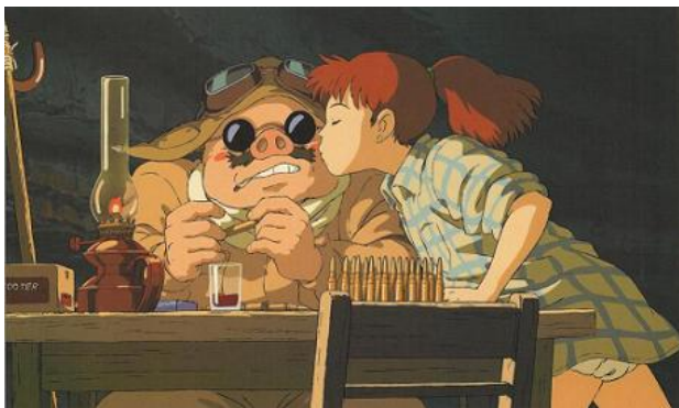
A scene from Porco Rosso

Miyazaki's movies are threaded with other personal obsessions, just as samurai imagery pervades Kurosawa's work. Pigs, for example, turn up in many films. ("The behavior of pigs is very similar to human behavior," Miyazaki has said. "I really like pigs at heart, for their strengths as well as their weaknesses.") A 1992 film, "Porco Rosso," tells the story of a pig that flies—he's a pilot who works the skies over the Adriatic before the Second World War. In one tender scene, the pig recalls the air battle in which his fellow flying aces just kept ascending—floating ever upward into a cold empyrean death—while he, a more earthbound creature, could not face such self-sacrifice. Next month, Disney, the American distributor of Miyazaki's films, will release a video version of "Porco," whose title character will be voiced by Michael Keaton. It will also make available an English version of "Nausicäa, with voices by Uma Thurman and Patrick Stewart. With these two releases, the entirety of Miyazaki's eccentric output will be available in good English versions for the first time.