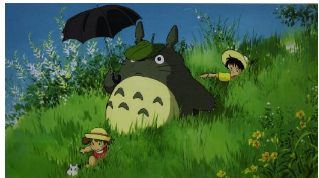
A scene from My Neighbor Totoro

Satsuki, are not idealized; they are at once goofy, brave, and vulnerable, like a lot of kids. The sisters have just moved with their father to a new house in rural Japan. Gradually, the two girls discover a host of strange but benign woodland creatures: fuzzy little soot sprites that hang out in old houses and hide when you turn on the lights; the plump, whiskered Totoros, who live in the roots of a giant camphor tree; and the marvelous cat bus, with its headlight eyes, caramel-colored stripes, and extra legs that function as wheels. (In a 1993 televised discussion between Miyazaki and the director Akira Kurosawa, Kurosawa mentioned how much he admired the sweetly surreal cat bus.) There is a gentle hint of Shintoism in all this: the father, an anthropologist, respectfully accepts the notion that the forest is presided over by spirits, though he is no longer able to see them, as his children can. Unlike the animals in most American cartoons, these creatures are not excessively anthropomorphized; they don’t speak, which somehow makes them seem both more plausible and more dignified, and which gives the girls the delightful challenge of interpreting them. In fact, the film is focused on dignifying the girls’ imaginations, honoring their ability to partake in a fantasy that is both comforting and fortifying—for we gradually learn that they are separated from their mother, who is ill and in the hospital.