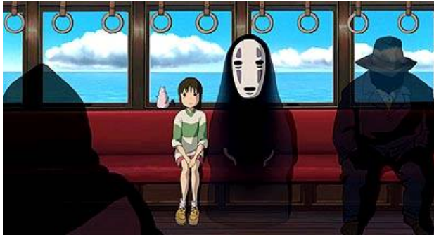
A scene from Spirited Away

both emotionally precise and fantastical. It's like every solitary journey you've ever taken, when you felt lonely and a little exalted, but it is also deeply strange, for the train glides, stately and surreal, over a translucent blue sea, while the sky slowly ripples through the possibilities of a sunset, from the pink of crushed petals to a soft, forgiving black.