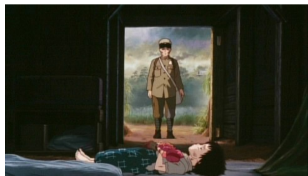
A scene from Grave of the Fireflies

Takahata and Miyazaki, who worked together so closely for years, have lately moved in different directions. Takahata is more interested in literary and film theory, more cerebral and less enamored of magic. His films are not for children, and “Grave of the Fireflies” could easily have been a live-action film. Takahata is sixty-nine, but he has a formidable head of dark hair and a handsome, unwrinkled face. “With Miyazaki, you have to totally believe in the world of the film,” Takahata told me. “He is demanding that the audience enter the world he has created completely. The audience is being asked to surrender.” He paused. “I want the audience to have a little distance. My relationship with him is limited now. We are friends but we don’t have a direct working relationship.”