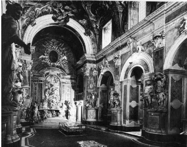
Figure 4: Cappella Sansevero de' Sangri, Naples, 1749-66.

of decadence. 22 He placed the Catholic Church at the heart of his analysis of the baroque as an artistic bruttezza , and Italy's decline ( decadenza ) from the middle of the sixteenth to the early eighteenth centuries in terms of 'entusiasmo morale' 'moral exuberance'. For him the baroque as a sort of brutto artistico was not artistic at all, but, on the contrary, something different from art, based on 'un bisogno pratico' ('a practical need'). 23 For Croce the word "baroque" specifically invokes the anima barocca , the baroque spirit, rather than particular forms – the anima barocca allows representation to become mere bravura and, unlike other ugly forms, leaves one stupefied, cold, and with a sense of emptiness. 24 This is crucial to Croce, since for him art is a liberator: 'By bringing them as objects before our minds, we detach them from ourselves and raise ourselves above them.' 25 In discussing the independence of art, Croce avers that 'that which is trivial or barren is only so insofar as it has not been raised to the level of expression; in other words, triviality and sterility always arise from the form given by aesthetic treatment, from its imperfect mastery of content, and not from the material qualities of the content itself.' 26 As for cause, the anima barocca is rooted deep in sinful human nature, but was produced by the Church, which collapsed religion into politics.