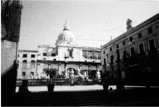
Figure 5: S. Caterina, Palermo, c.1598. North side from Piazza Pretoria.

temporal break. Jetztzeit or ‘now-time’ becomes visible in states of emergency, and the repressed memory of ‘those without a name’ can repossess a history fashioned by the historicism of the victors. 59 He writes: