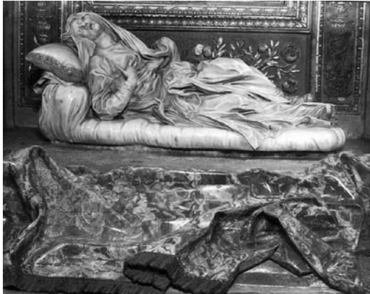
Figure 9: Gianlorenzo Bernini, Blessed Ludovica Albertoni, 1674. S. Francesco a Ripa, Rome.