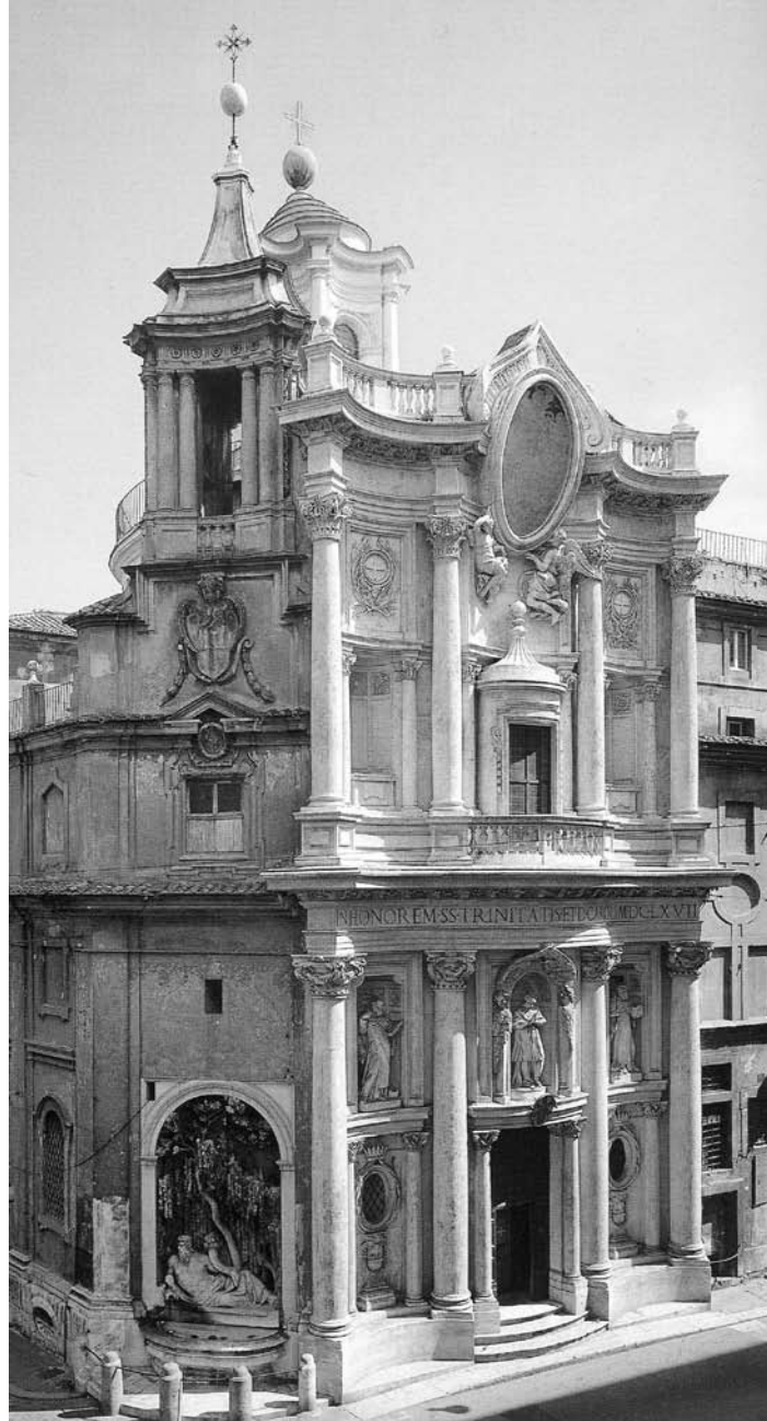
Figure 1: Francesco Borromini, S. Carlo alle Quattro Fontane, Rome, 1665-67. Façade.

In recent times historians have tended to shrink with embarrassment from the term “baroque” and to opt instead for “early modern”, a term which is doubly problematic in prompting a conception of history which is inherently linear, and of the earlier period in subordinate teleological relation to the “modern”. 1 Within history of art “baroque” has been treated with less disdain. It continues to be deployed broadly within the discipline to refer either to a broad chronological period (usually a long seventeenth century), or to an artistic style, or to both (period and style seen as overlapping). In this paper I investigate what might be recovered from the term “baroque” by exploring the radically divergent ways in which it has been used: on the one hand as a term of periodisation, a stylistic label, and an epithet largely of abuse; and, on the other, as an anti-historicist critical strategy, as a way to avoid the over-identification of appearance with period. I aim here to bring diverse approaches to “baroque” into dialogue.