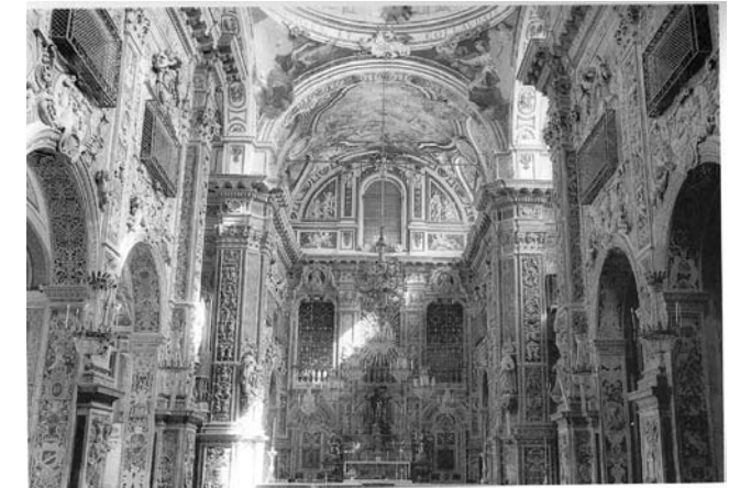
Figure 6: S. Caterina, Palermo. Interior looking east. Chancel decorated 1705-20.

In other words, while the writers cited above regard appearance precisely as giving access to essence, Benjamin regards this relationship as difficult and