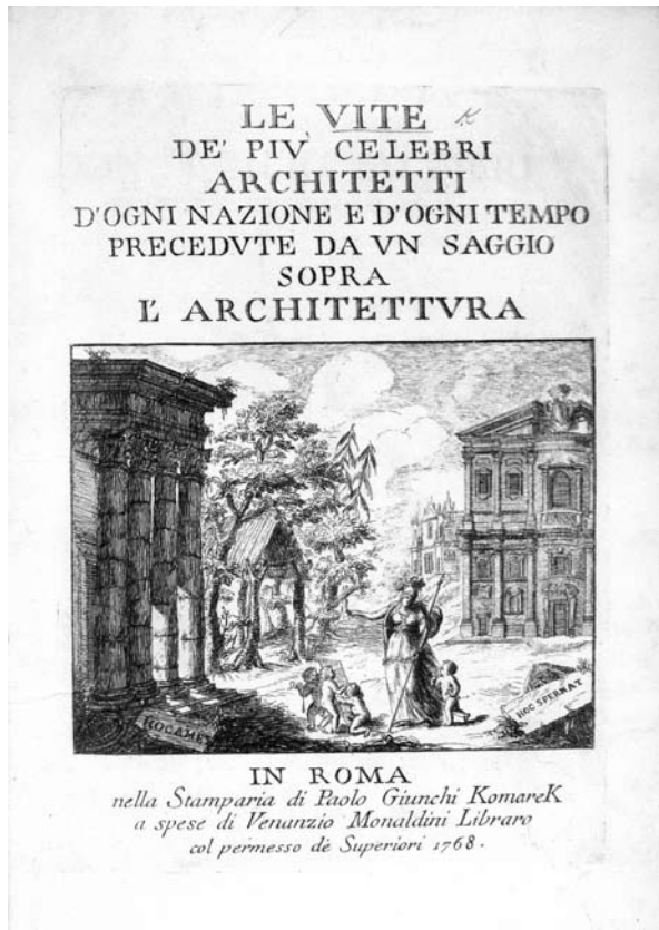
Figure 3: Title page to Francesco Milizia, Vite de' più celebri Architetti d'ogni nazione e d'ogni tempo (Rome: Paolo Giunchi Komarek), 1768.