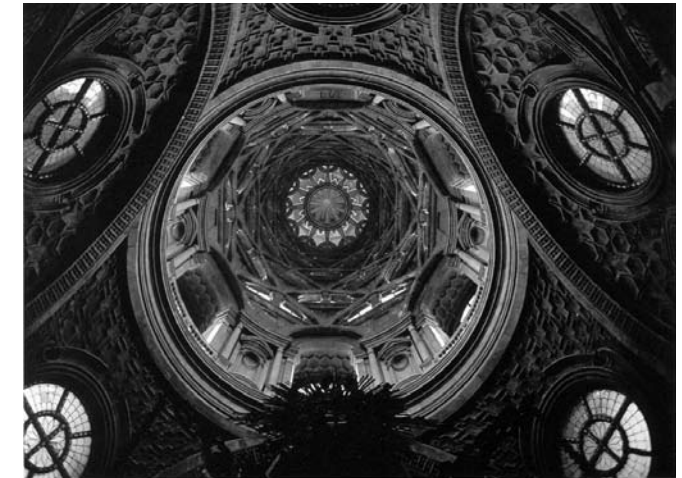
Figure 2: Guarino Guarini, Cappella SS. Sindone, Turin, 1667-90. View into dome.

In the Encyclopédie Méthodique: Architecture (1788-1825), aimed in part at producing an appropriate public audience for emerging public architectures, Quatremère de Quincy seems to conceive of baroque as its nemesis, the product of the merely curious (as opposed to the connoisseur). He defines “baroque” in architecture as a nuance of the bizarre. ‘It is, if you like, its refinement, or, if it were possible to say so, its abuse.’ 8 For him the essence of the baroque is its excessive bizarreness, its unrestrained eccentricity: ‘What severity is to the prudence of [good] taste, the baroque is to the bizarre. That is to say, it is its superlative.’ It is not simply eccentric, but bizarrerie or ridiculousness pushed to the extreme. 9 Quatremère thus distinguishes between “baroque” and “bizarre”, the one being the excess of the other: Borromini, whom Quatremère regards as motivated mostly by jealousy of Bernini, ‘provided the greatest models of bizarrerie ’, while Guarini passes for ‘the master of the baroque’; and he cites Guarini’s SS Sindone Chapel in Turin as the most striking example of the taste (Fig 2). 10