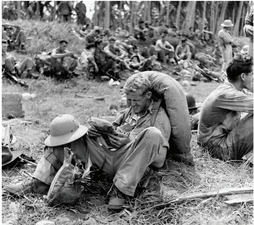
Marines newly arrived on the island. Note the prewar pith-helmet.

At that time, the priority destination for US troops and equipment