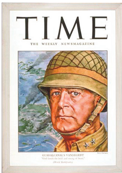
Vandergrift as he appeared on the cover of Time magazine.

secure a perimeter and then, with the limited rifle strength available, be prepared to stop the expected Japanese counterattack that, he believed, would be delivered amphibiously over the beaches. (After all, the Japanese had successfully used that tactic all across the Pacific during that same year's first half. Further, when the Allied naval task force that brought the Marines to the island hurriedly pulled out on the evening of 8 August, it did so under the perceived threat of a Japanese aero-naval counteroffensive being in the offing.) The second task was simply to hold the airfield itself at all costs.