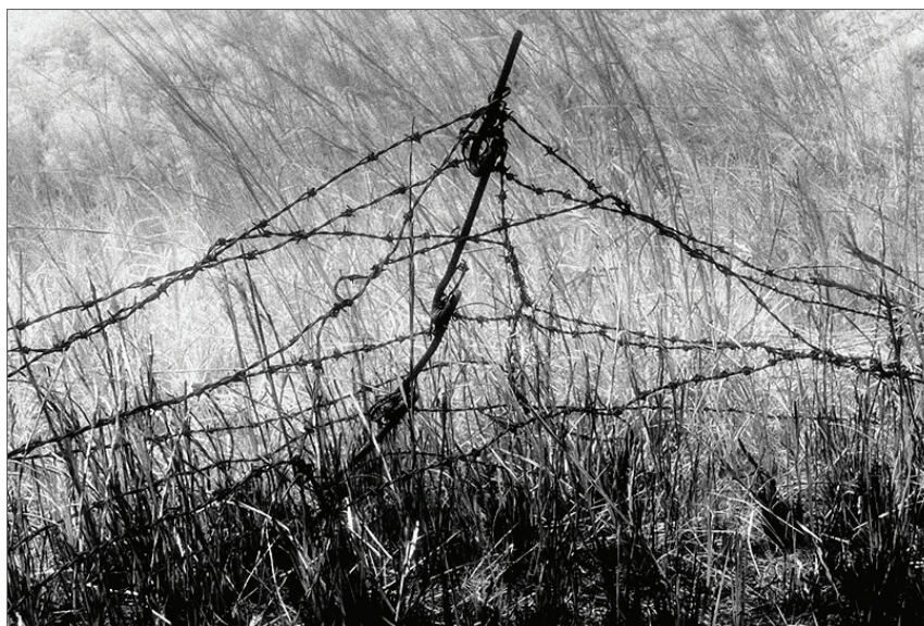
Some Marine barbed wire running through the elephant grass at the base of Hill 123.