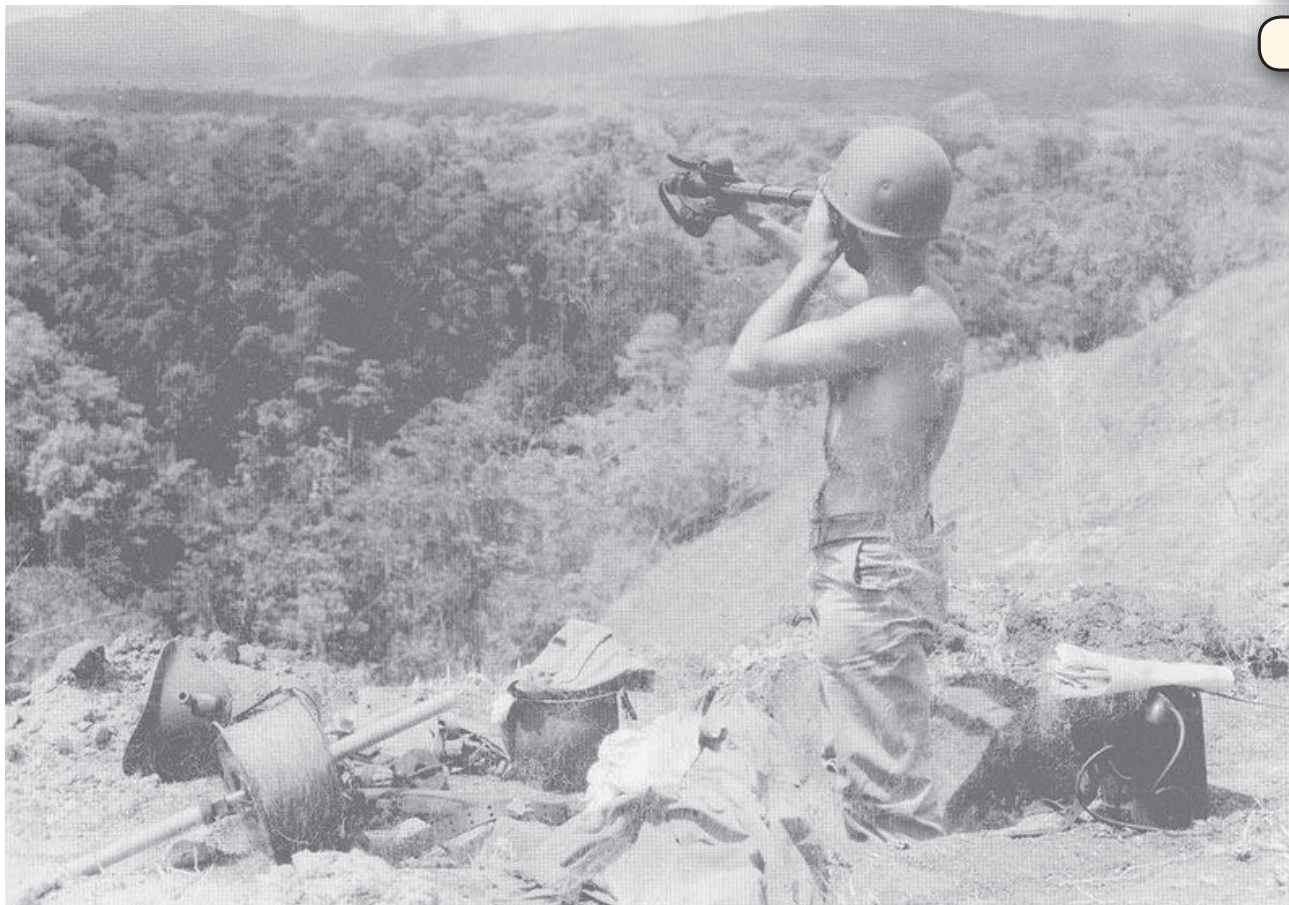
The view from Hill 80.

The south of the island is filled with steep ridges that descend to coral reefs, making naval landings there untenable. The island is filled with rugged ridgelines, eroded and bald at their heights. Below the ridges are dense jungles, filled with a great variety of species of birds and large insects. Tarantulas, red ants, centipedes, bush rats, crabs and iguanas comb the island. Shallow rivers and creeks filled with crocodiles meander through the land. In the mountains the rivers form dangerous rapids. Impenetrable mangrove swamps and lagoons border the long sandy coastline.