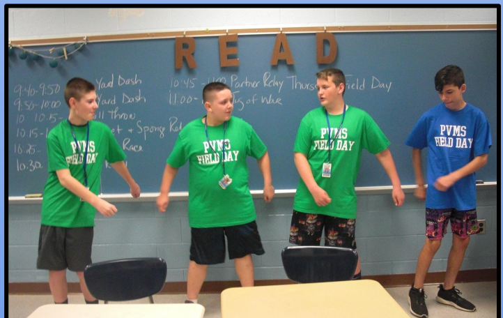
Students thinking about only three days of school left... all together, floss!!!

Read, write, garden, travel, and run! -- Mrs. Krall