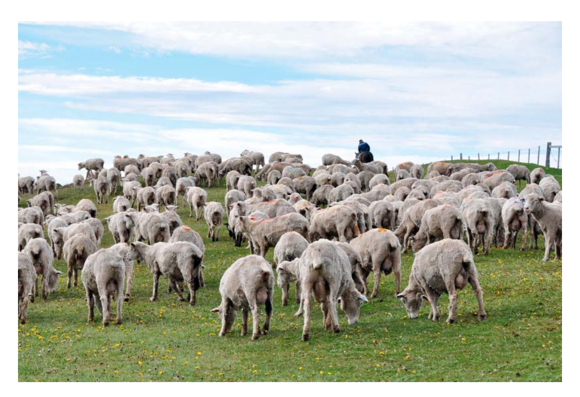
Figure 4. Sheep being moved to a summer pasture after sheering, Isla Grande, Chile.

identity linked to a particular colonial heritage. Owners worry about the cost of production, technologies of breeding, and the price of wool and are increasingly interested in new approaches to rangeland management. Like beavers, sheep are entangled in complicated global assemblages of animals, humans, infrastructure, technology, and related discursive logics. Sheep stock is imported from New Zealand, the Falkland's, and South Africa. Their wool is shipped for grading in New Zealand, then sold through multinational corporations, and often shipped to China, where the wool is made into sweaters and other commodities.