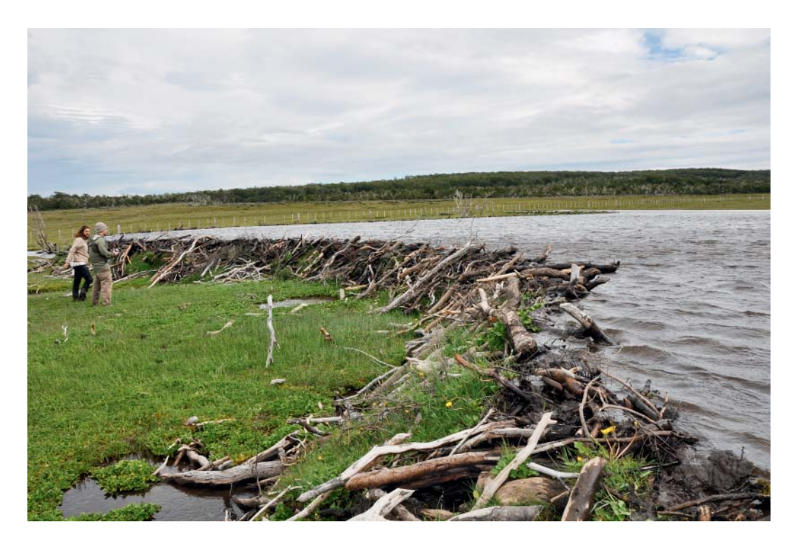
Figure 5. Beaver pond on Estancia Marel, Isla Grande, Chile.

Estancia workers (called ovejeros ) and shepherds (called puesteros ) worry about lambs freezing to death or lambs being killed by predators, but mainly they are attentive to working conditions. Estancia life in Tierra del Fuego is isolated and difficult. Most of the estancia workers in Chilean Tierra del Fuego come from Chiloe, reflecting a multigenerational tradition of labor migration from this southeastern coastal island. Workers tend to spend a decade or more on Tierra del Fuego estancias, rarely returning to Chiloe to see families, living in bunkhouses with a handful of other men. Shepherds, who accompany sheep out to far pastures, live even more solitary lives, spending months at a time at remote outposts with only their dogs and a horse for companionship.