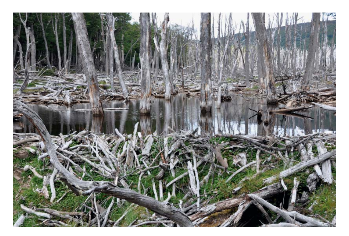
Figure 1. Silvery timber litters the landscape after a beaver dam has flooded the forest in Karukinka Nature Reserve, Isla Grande, Chile.

Archipelago, as in many other places in the world, scientific and political concerns over invasive species, particularly beavers, dominate the ways the landscape's wilderness identity and related practices of care are produced and contested.