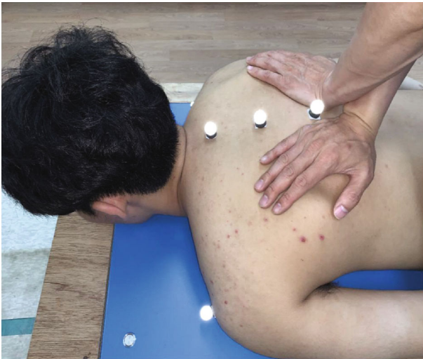
FIGURE 2: Posterior to anterior thoracic spinal manipulation (TSM).

participant's position was stabilized, and he/she was asked to inhale and fully exhale. At the end of the respiratory cycle, the therapist delivered a posterior to anterior impulse to the target spinal level (Figure 2).