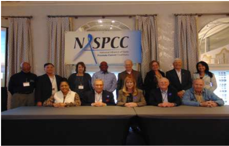
(Pictured above is the newly elected 2019-2020 Board, *some members not pictured)