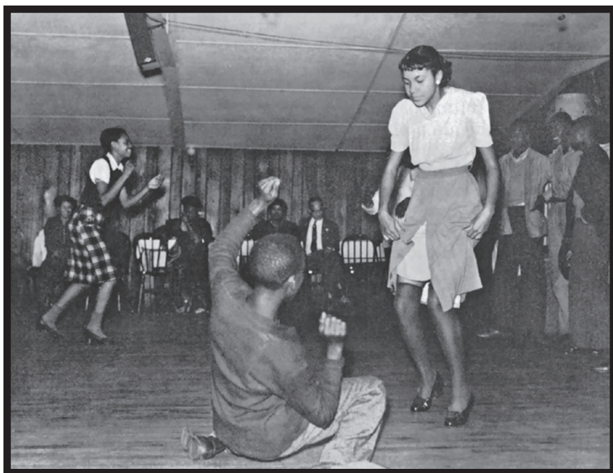
Dancing at a juke joint, Memphis, 1939.