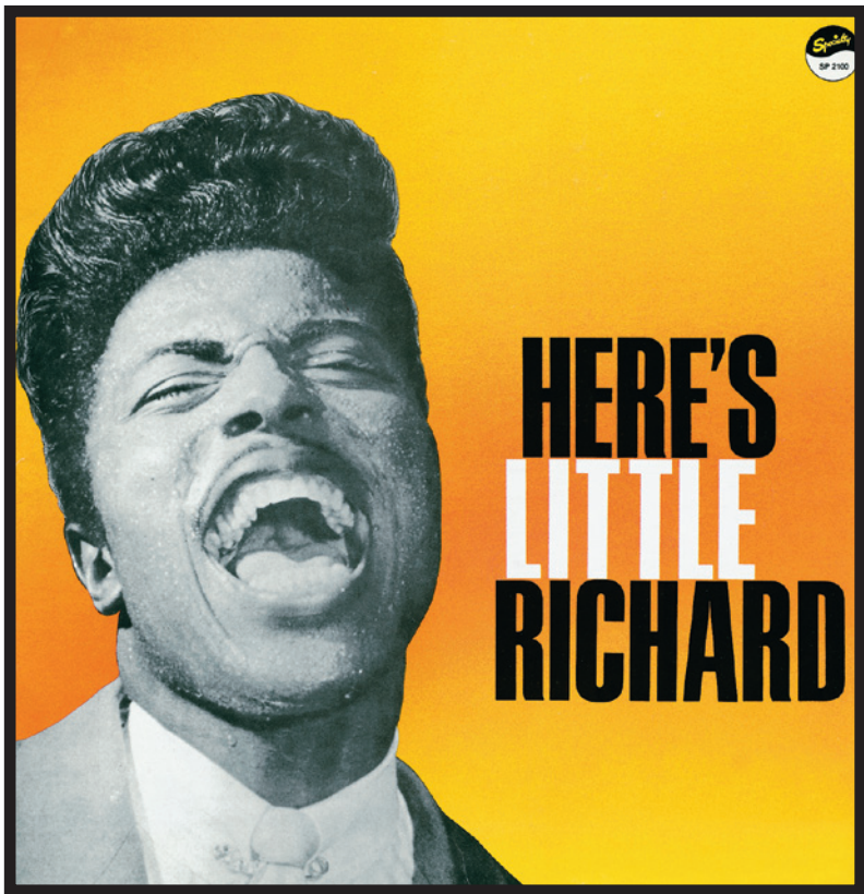
The fabulous Little Richard.

standards, which defined the new music: “Long Tall Sally,” “Slippin’ and Slidin’,” “Rip It Up,” “Ready Teddy,” “The Girl Can’t Help It,” “Good Golly Miss Molly,” “Jenny, Jenny,” “Keep a Knockin’,” and “Lucille.”