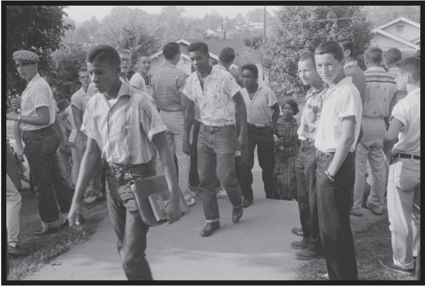
School integration, Tennessee, 1956.

an increasingly affluent and consumer-based society paved the way for the mass consumption of rock music.