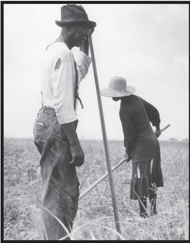
On the plantation, 1937. Photo by Dorothea Lange. Permission by Library of Congress, F34-17335.

The blues appropriated the African-based sound that spirituals had first captured and combined it with European harmony. It featured a centuries-old, twelve-bar European harmonic progression in a standard 4/4 time. Over the twelve-bar format, the music generally repeated a set of three chords to create a call-and-response effect. In the lyrics, the singer did the same by reiterating a line twice before embellishing it with a third line in a pattern called AAB. On the bass or the bass notes, the music emphasized a three-note riff to create a distinctive and dominant rhythm sometimes called a groove or a shuffle.