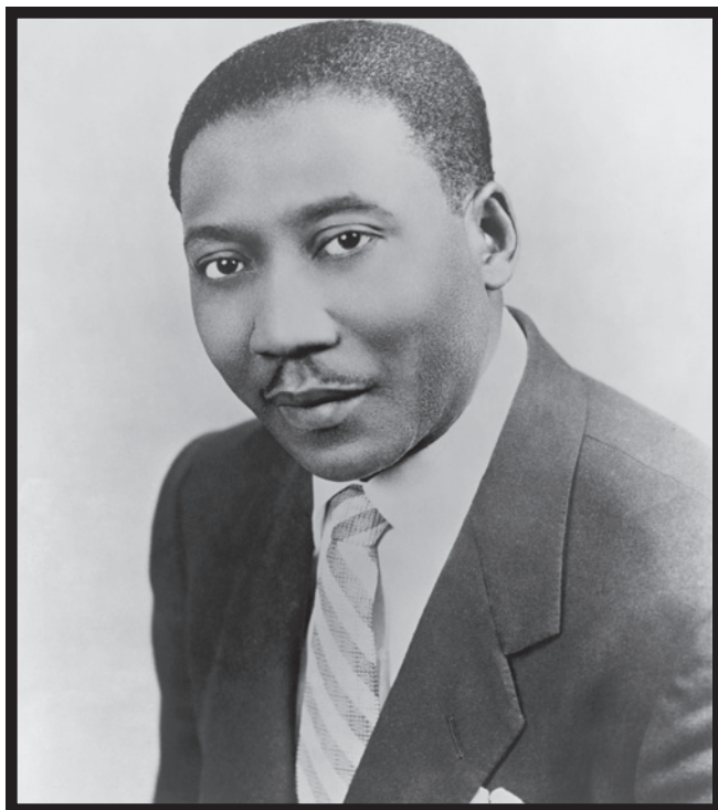
Muddy Waters, 1950s.

jukebox, and see my record on there. . . . Pretty soon I'd hear it walking along the street. I'd hear it driving along the street."