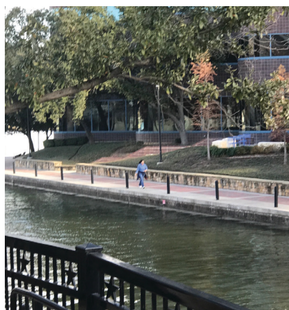
The Canals at Las Colinas