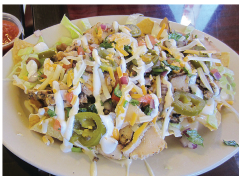
Chicken Nachos with white queso

What sets this place apart is the ability to customize your order. First,