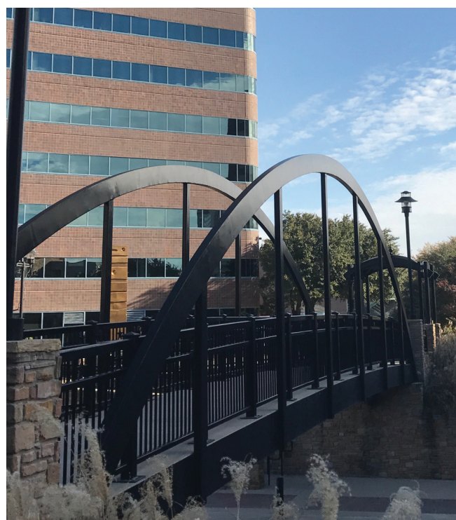
Scenic bridge on Las Colinas Boulevard

*Take caution when walking at dawn and dusk hours, wear reflective clothing. Remember to hydrate. During summertime, it is important to use SPF, wear sun protection and SPF clothing.