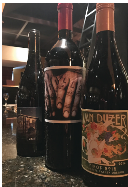
Some of the top selling wines at i Fratelli Ristorante and Wine Bar

Wine drinkers can find bliss at i Fratelli Ristorante and Wine Bar located. With over 100 wines available, i Fratelli brings glasses of varietals from Washington, California, Argentina, Italy and many other countries. Aside from wine, the bar also offers classic cocktails and beer for those who aren't in the mood for vino. What is unique about this place, besides the tons of wine options is that you will not find one TV in the bar. The lack of TVs definitely creates a more organic ambiance of soft voices and less distraction so one can focus on their partners, friends, food, and wine. A breath of fresh air in modern society.