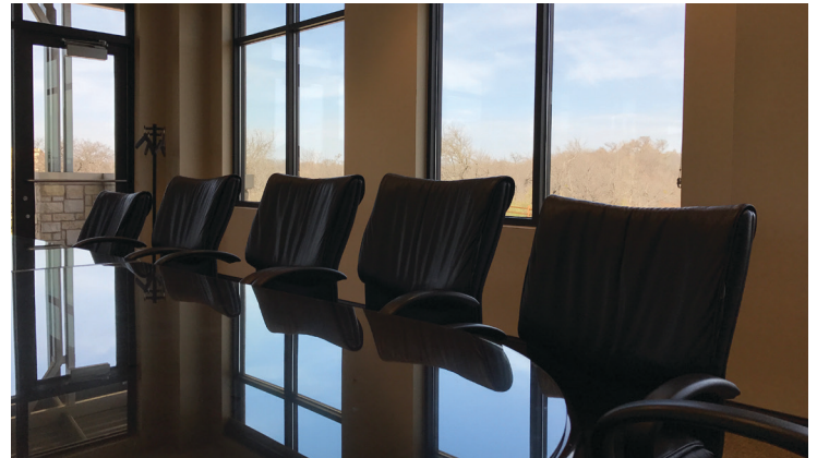
Carpenter Hall at the Las Colinas Association.

The Las Colinas Association Annual Meeting of Members takes place every year for the purpose of electing board members and voting on other business that may come before the board. Before the meeting can take place, however, there must be a quorum which is why it is important that we receive your proxy as-soon-as-possible. The quorum pertains to the minimum number of member votes needed to conduct business during the meeting. The Annual Meeting notice and proxies were recently mailed to all property owner members. If a member did not receive their proxy, please call 972-541-2345 to have the forms resent.