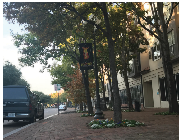
Las Colinas Boulevard