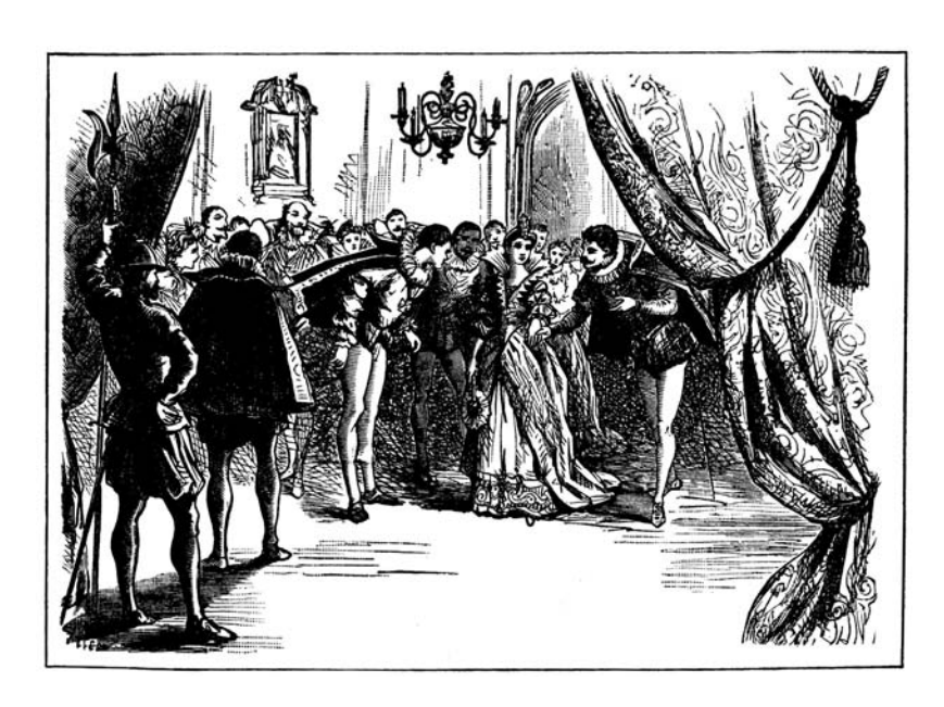
CINDERELLA AT THE BALL