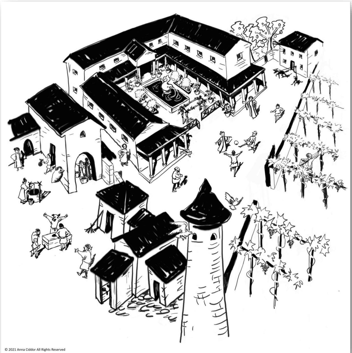
ILLUSTRATION 1: Villa Rubia