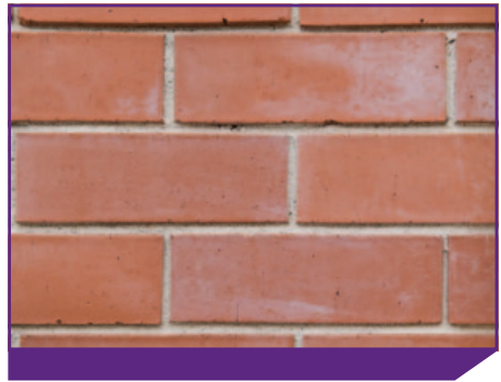
Typical calcium stain from wet sponging mortar joints