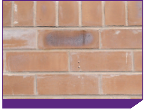
Signs of manganese staining