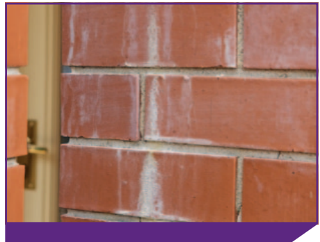
Calcium stains leaching from adjacent concrete balcony