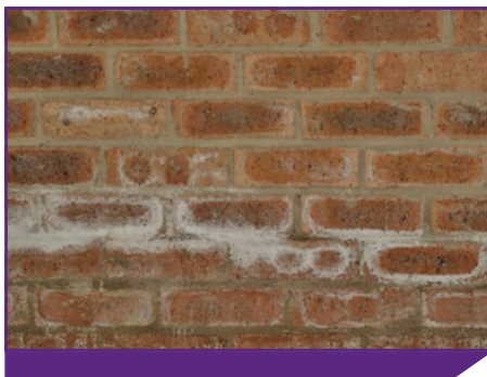
Efflorescence from ground salts