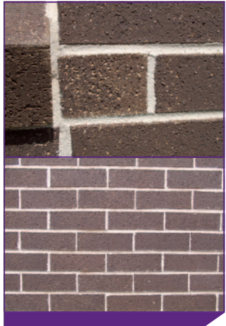
Damage to bricks caused by incorrect use of high pressure water jet cleaning