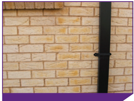
Acid burn on light coloured bricks