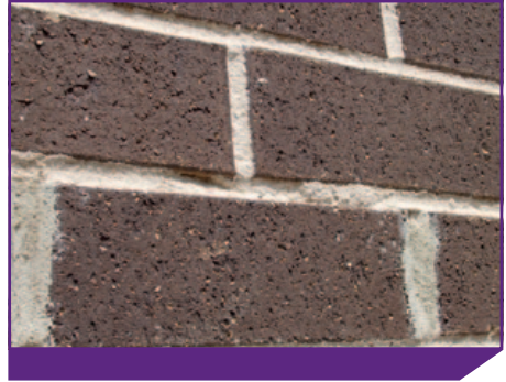
Damage to ironed mortar joint

6. Allow the cleaning solution to remain on the wall to allow the chemical reaction to take place, this could take up to 3 to 6 minutes, however for bricks manufactured in Queensland and Western Australia a lesser time is advised or secondary staining can occur.