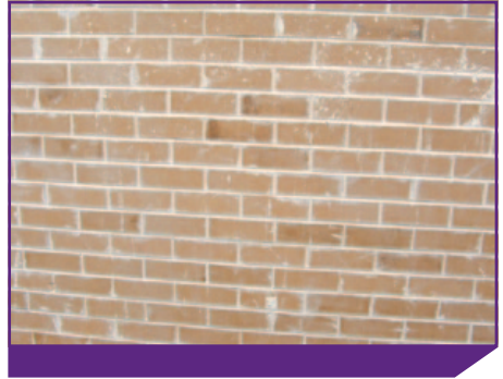
Typical wall after brick laying