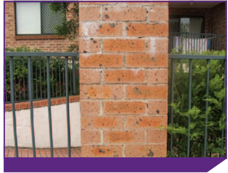
Acid burn on face brick work

Pre-wetting and frequent washing off is designed to prevent undue penetration of the acid into the brick and mortar where further reactions and staining often occur. Window sills and corners require particular attention with pre-wetting as the water readily runs off instead of being absorbed.