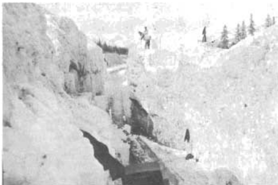
This snow slide came down about 10 miles west of Fernie, B.C. in 1930. It was dug out by hand by a relief crew stationed at Elko, B.C.