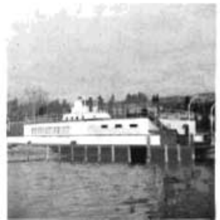
the left. No longer needed after the Okanagan Lake Bridge opened in July, 1958, the "Pendozi" was turned over the City of Kelowna which later donated it to the Westbank Yacht Club. It is shown in the right picture permanently berthed in Gallatly Bay, Westbank.