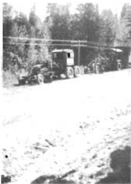
A 1939 and a 1930 Sawyer-Massey grading the old Cariboo Highway in 1942. The 1930 grader (L-20) could be purchased for $4,933 and rented for $10 a day in those days.

In 1921 the Department hired a special "traffic enumerator" to keep a record of motor vehicle volumes on the Pacific Highway and on Scott Road. The results on an average day: 312 vehicles on Pacific Highway and 123 on Scott Road. Today's corresponding figures: 3,550 vehicles on Pacific Highway and 4,110 on Scott Road.