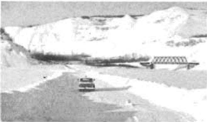
During the winter months an ice crossing is maintained at the Clayhurst crossing over the Peace River. The crossing is one of three links between the South Peace River and North Peace River Districts and is of considerable importance to the entire Peace River Community.