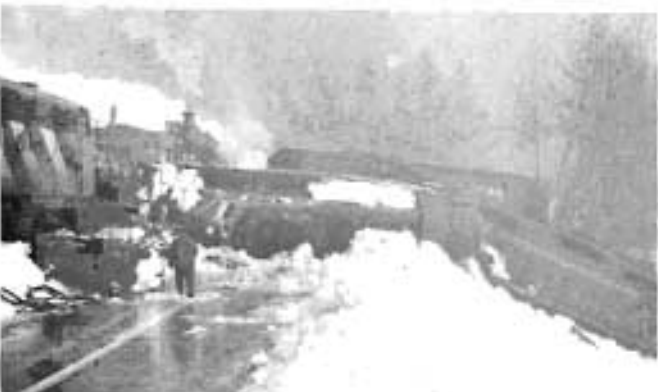
At 11:30 p.m. February 5, 1967, a C.N.R. train derailed 40 miles west of Terrace blocked Highway 16 for three days. A 70 car westbound freight train loaded with wheat, struck a snow slide, derailing both engines and 13 boxcars. Engines and box cars came to rest in a tangled mess on the highway. Both engineer and fireman escaped without seri-