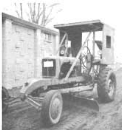
An old grader still in use in the Parksville area by private contractors. The make is unknown. Does anyone recognize this model?