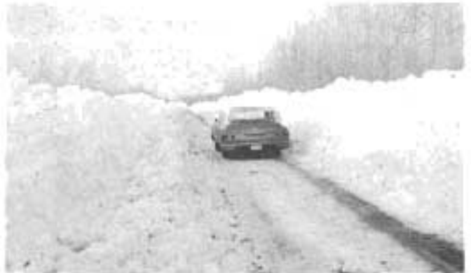
Have snow! Will sell at lowest known rate with understanding that buyer removes goods from public roadways at his own expense and that such removal be carried out as, when and where the snow falls and or drifts upon public roadways . . . Note depth of snow by comparison with District Officials' car on Pouce Coupe Highway.