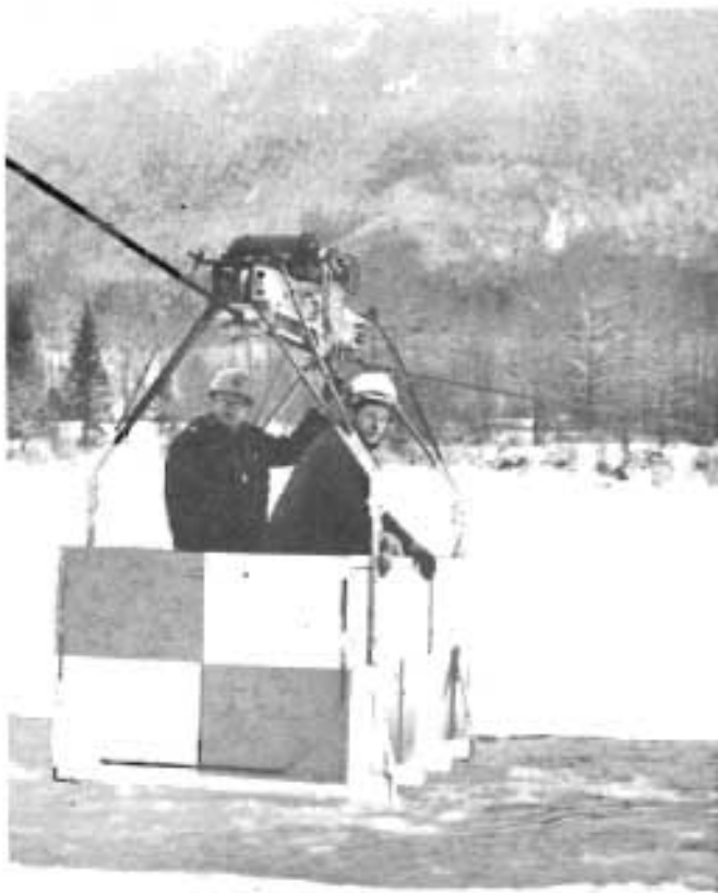
An aerial cage capable of carrying an operator and three adult passengers went into operation across 800 feet of the Skeena River at Usk, B.C. on February 1, 1967. Art Olson, Bridge Foreman, and Mitch Kohl, Bridge Truck Driver, are shown making one of the first aerial crossings