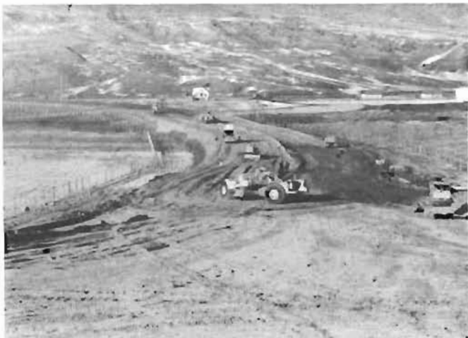
Kamloops District and hired equipment at work on the construction of approach and surcharge for a new bridge on the North Thompson Highway at Kamloops.