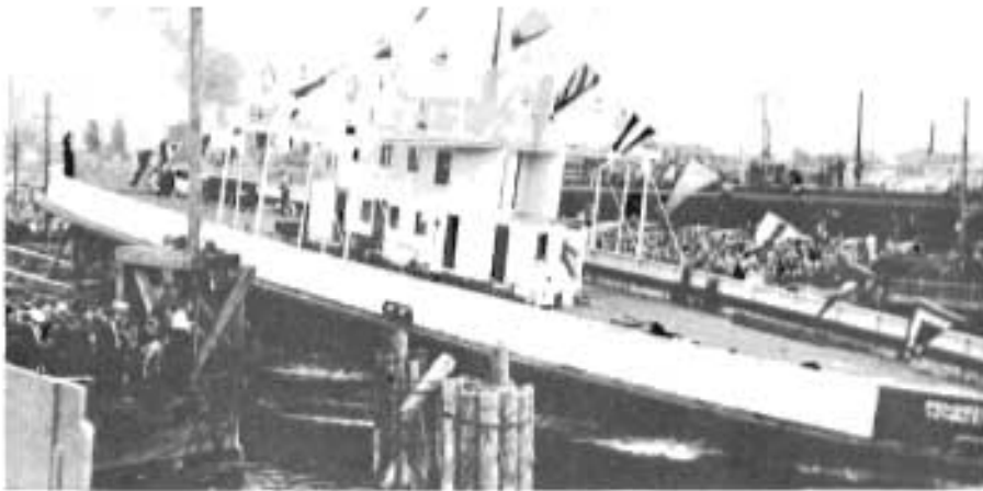
The Westbank Yacht Club premises, formerly the ferry MV "Pendozi", was the scene of a recent party hosted by the Westbank Highway crew. About 120 District personnel and their friends attended. The 130 foot long ferry was built in Kelowna in 1937. The launching is shown in the picture on