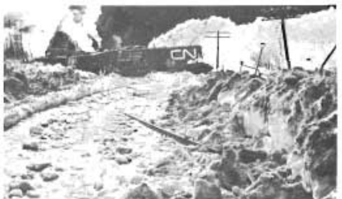
ous injury. Little assistance could be afforded by Department of Highways crews because special crane equipment was required by the railway to lift the heavy boxcars and diesel engines. The picture on the left shows engines lying on the pavement, one almost in the Skeena River, the one on the right, derailed cars after striking the snowslide.