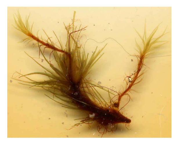
Illustration: Tortella fragilis producing T. tortuosa -type branches in cultivation on nutrient solution

directly reveal the tree-like or networked evolutionary past than does standard phylogenetic analysis that uses presumably evolutionarily neutral (I.I.D.) non-coding and non-regulatory DNA, or synonymous codons to create nested sets of events of inferred genetic isolation following the Biological Species Concept.