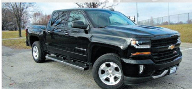
2018 Chevy Silverado 1500