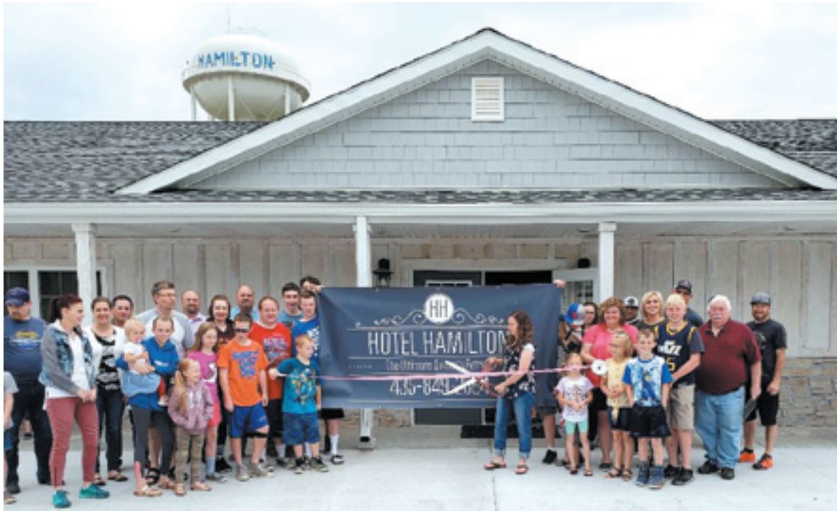
Ribbon cutting at the Event Center in Hamilton