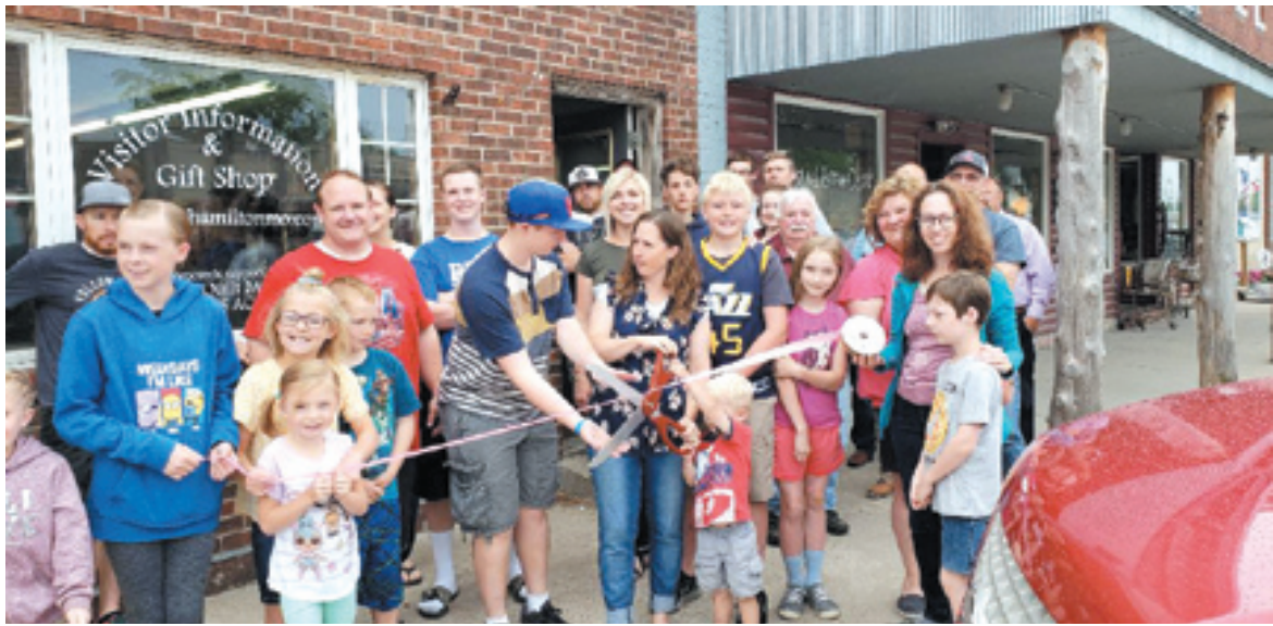
Ribbon cutting at the Visitors Center in Hamilton