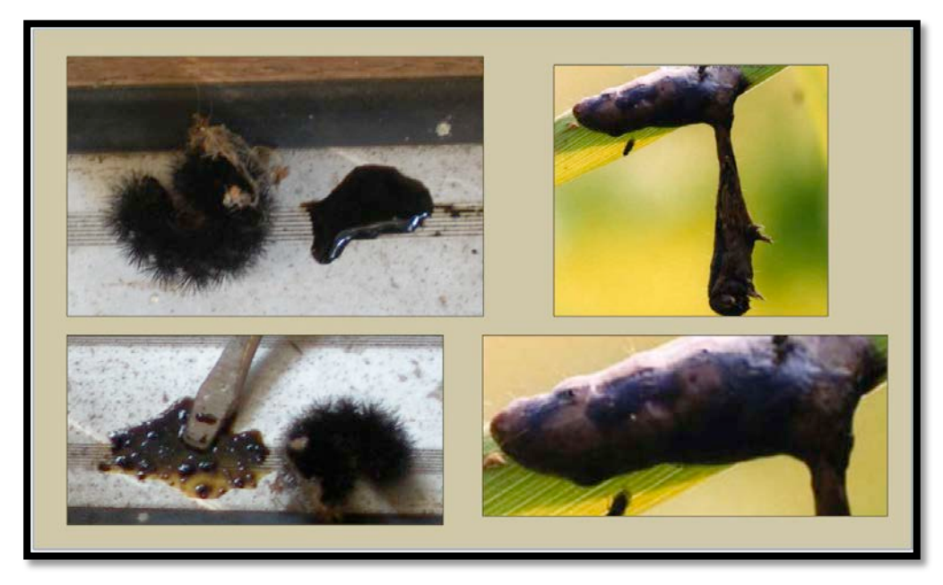
Zombie Caterpillars Rain Death From Trees, Sept. 8, 2011 Note the small egg shaped 'things' within the liquid.

A single gene in a caterpillar virus sends its victims running for the treetops, where they die and their bodies liquefy, sending an ooze of virus particles on their brothers and sisters below.