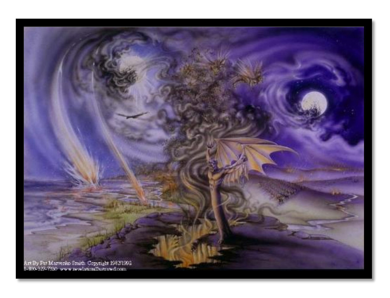
The First Six Trumpet Judgments