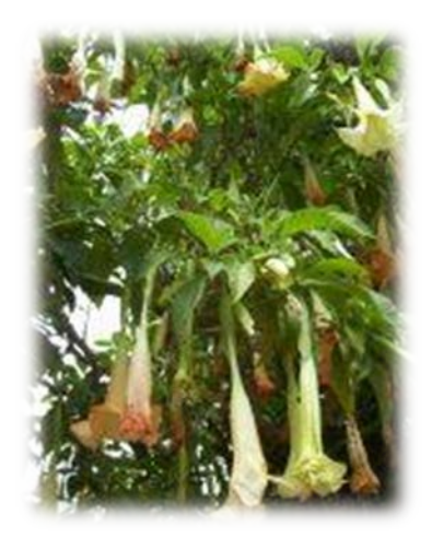
Angel's Trumpet

By examining historical evidence, disease patterns and similar neuro-toxins, scientists are finding strong links to toxins, virus and specifically scopolamine, an active agent of the burundanga plant. Scopolamine has been used for centuries for ritual magic as well as criminal activity in the Western Hemisphere. (National Institutes for Health, 1985).