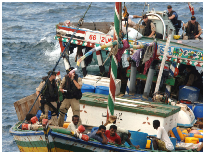
Searching a vessel

This RHIB ride was part of an operational boarding that Ottawa conducted while deployed to the Middle East. These boardings were a large contributor to Canada's maritime commitment to the Global War on Terror and would become a daily occurrence for the men and women who served during this six-month tour that spanned the regions from Somalia to the Persian Gulf and finally the Red Sea.