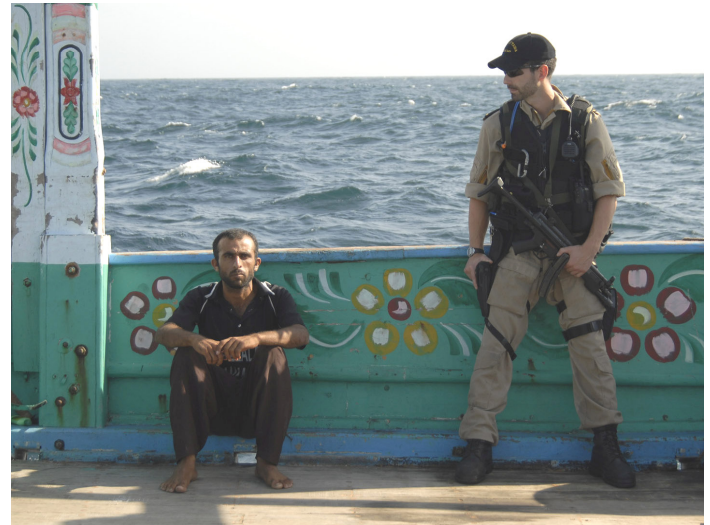
Keeping an eye on a suspect passenger

Ottawa would conduct as many as sixteen boardings in a day, with the team working until just after sunset, however, not everyday saw the team floating in the open ocean. This adaptability proved necessary to accomplish other roles that Ottawa played while deployed.