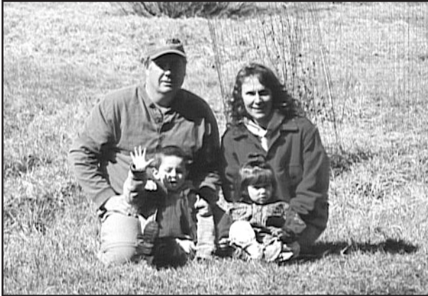
The Koon family at Sand Creek Ranch

Quote: ‘Just Breathe’ – “Living a remote life with our nearest neighbors three miles away, Steve and I can still get stressed out and need to be reminded to just breathe.”