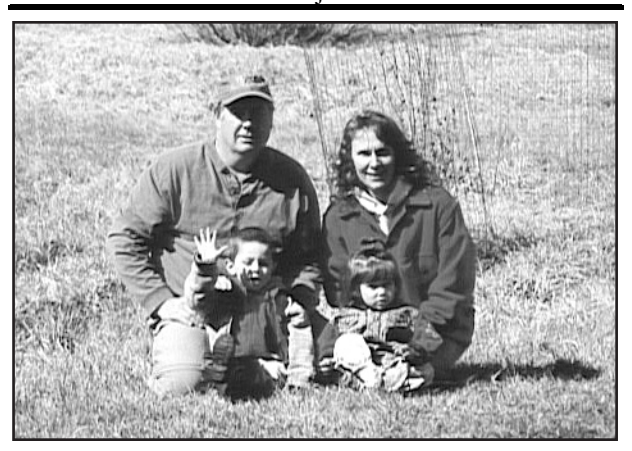
The Koon family at Sand Creek Ranch

Quote: 'Just Breathe' – "Living a remote life with our nearest neighbors three miles away, Steve and I can still get stressed out and need to be reminded to just breathe."