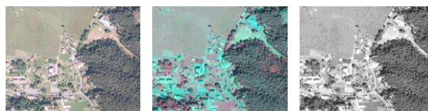
Figure 1. True colour (left), false colour (middle) and grayscale (monochrome) (right) image

City plans can be mentioned as an example of topographic image map. They are compiled from aerial images complemented by a symbol component consisting of street labels. Image maps replacing conventional topographic maps but taking over scale and symbology, can be presented as another example (see topographic image map example below).