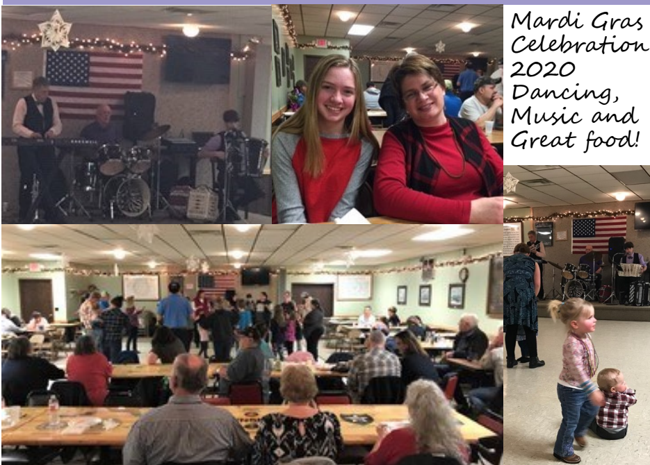
Mardi Gras Celebration 2020 Dancing, Music and Great food!