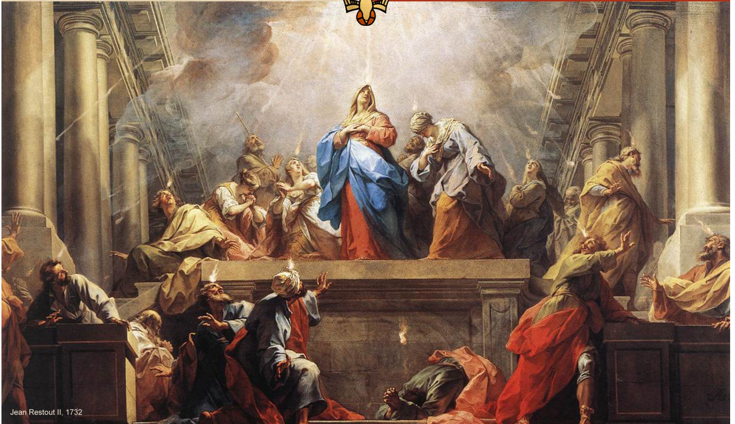
Jean Restout II, 1732