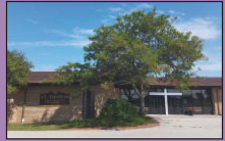
St. Thomas the Apostle