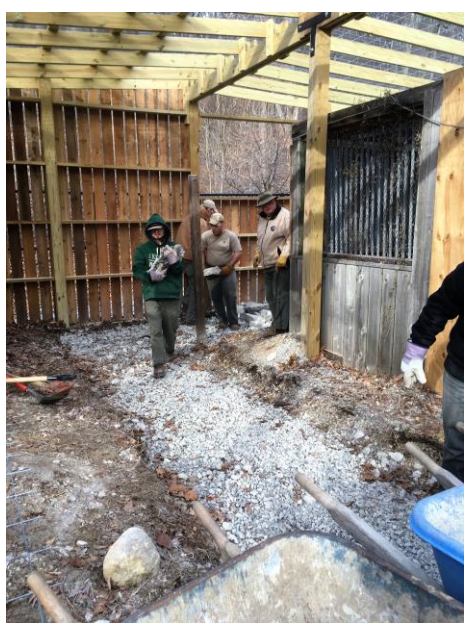
Working at the Aviary at Cunningham Dutch Oven cooking and LUNCH Falls State Park