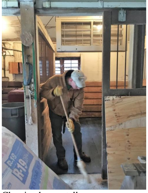
Cleaning horse stalls