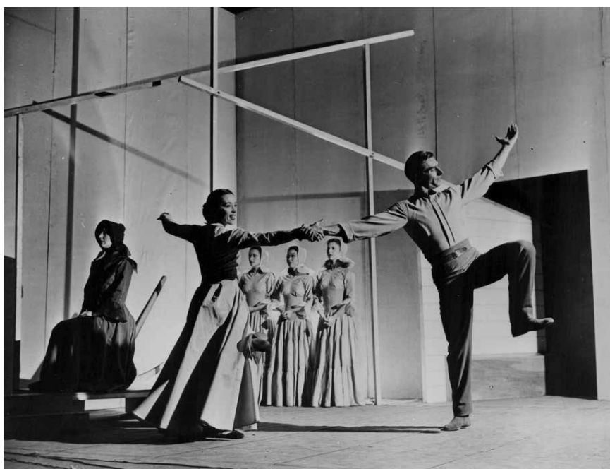
Martha Graham and ensemble in Appalachian Spring

“And over and over again nowadays people come up to me after seeing the ballet on stage and say, ‘Mr. Copland, when I see that ballet and when I hear your music, I can just see the Appalachians and feel spring.’...I’ve begun to see the Appalachians myself a little bit [laughs].” 3