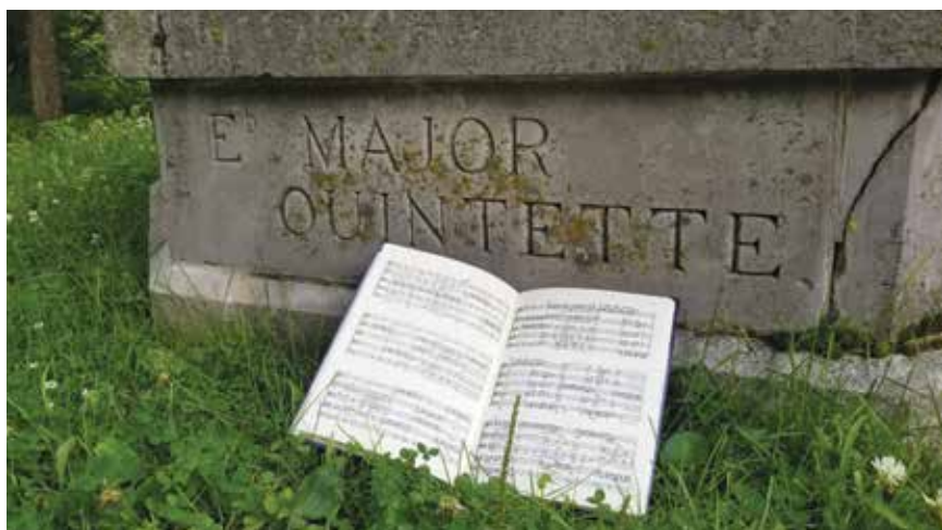
A memorial to Dvořák in Riverside Park, Spillville, Iowa, inscribed with the pieces Dvořák wrote during his stay.