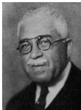
Harry Thacker Burleigh in 1936

If one were to leaf through any musical survey textbook, it might seem that the only music worth studying was written in a palace or a conservatory in Europe. But the truth is that people all over the world have contributed to the robust and rich catalog of music history. Harry T. Burleigh is perhaps best known for sharing negro spirituals and folk melodies with his teacher, the Czech composer Antonín Dvořák (up next on this program). Yet, he was also an accomplished composer in his own right. His grandfather, a freed slave, taught Burleigh traditional spirituals and slave songs. Burleigh bridged this heritage with art-song, and the Southland Sketches is a superb example of this synergy.