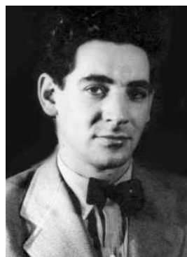
Leonard Bernstein in 1944

We might only remember Leonard Bernstein as a famous conductor of the New York Philharmonic. We could exclusively play his famous popular works, like Candide (1956) and West Side Story (1957). Or we could, at most, know his Bostonian accent from the many lectures and pre-concert talks that he gave on television and in concert halls. But of course, Bernstein was all of this, and more.