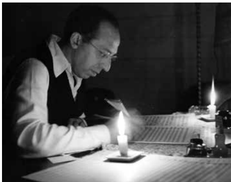
Aaron Copland in 1944.

For a man who many summarize as the “iconic” American composer, Aaron Copland’s catalog reveals a significant struggle with identity and voice. He studied in Paris in the 1920s with Nadia Boulanger, and returned to Boston with a Stravinsky/Jazz fusion in his unorthodox symphony, the Symphony for Organ and Orchestra (1924). Copland discovered serialist techniques in the ‘30s, but much of his work was considered percussive and difficult. A few admired him as a “non-melodic intellectual.” 2 Yet by the 1940s, Copland shifted his values again—this time, wondering how a composer could communicate with a wider audience. Coinciding with the outbreak of World War 2, many of Copland’s most famous compositions, including Lincoln Portrait (1942) and Fanfare for the Common Man (1942), show a marked turn towards patriotic and Americana themes.