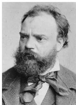
Antonín Dvořák in 1882

Spillville, Iowa, sits in a small valley about 126 miles north of Iowa City. Antonín Dvořák spent the summer of 1893 there, writing several pieces that helped establish an “American” voice in an otherwise Eurocentric classical music scene.