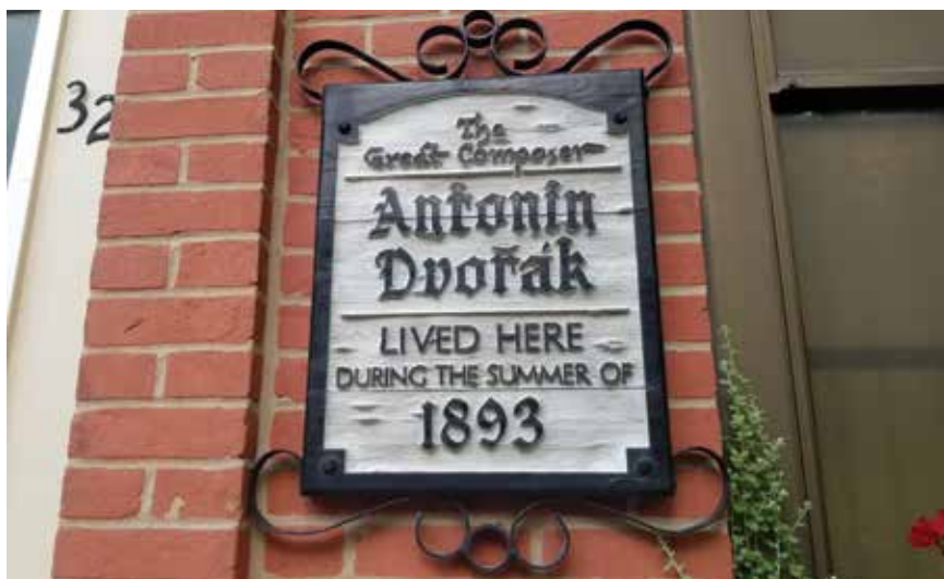
Dvořák and his family lived in Spillville, Iowa, the summer of 1893.