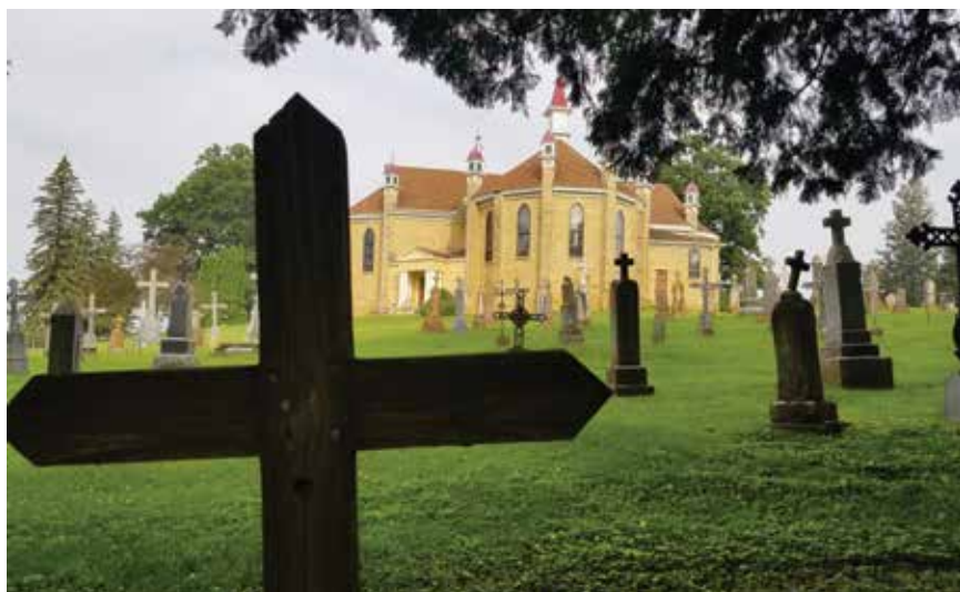
Saint Wenceslaus Catholic Church in Spillville, Iowa, which dates to 1860, is the oldest Czech Catholic church in the United States.