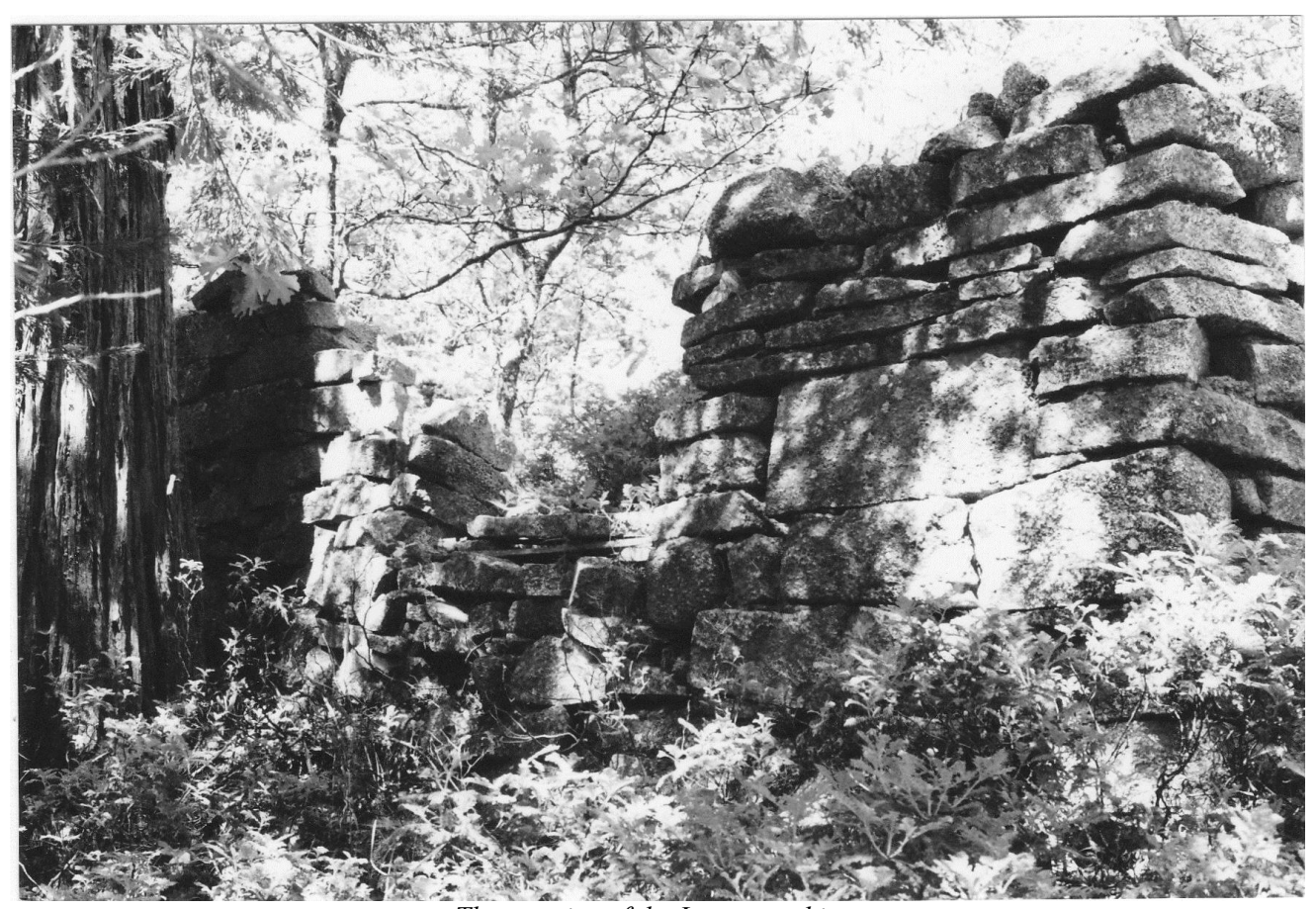
The remains of the Lawson cabin.

Somewhere along Whiskey Ridge, in the shadow of Mormon Hill, amid the pines and the oaks, is a small, unmarked grave. Within that grave are the remains of a little girl whose name no one remembers, along with the secret of the tragedy that ended her life.