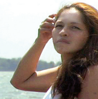
La Americana