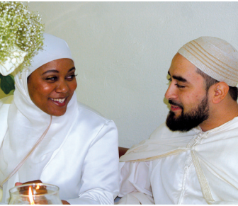
New Muslim Cool