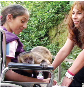
La Americana