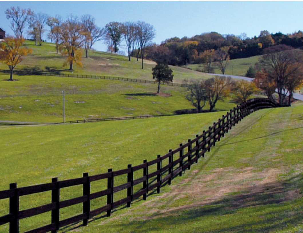
Welcome to Shelbyville