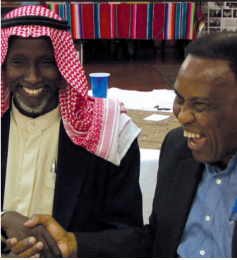
Welcome to Shelbyville