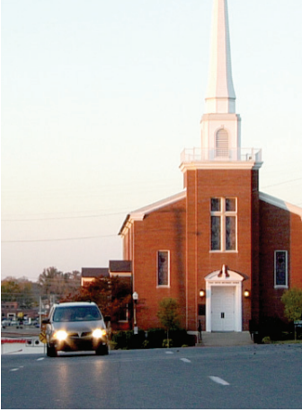
Welcome to Shelbyville, Photo: Greg Poschman

Preaching to the choir is often maligned as a useless practice. But preachers do it every week, and with good reason: it’s part of how they build a community of belief and mutual support. The audience at a documentary film screening is often not so unlike a church congregation. People may go to see an advocacy film they already agree with, or share their anger or grief with a like-minded audience or rally themselves for action. Consider the house-party screenings of Robert Greenaway’s documentaries on Wal-Mart or the Iraq War. Such screenings can be a uniquely effective way for the “choir” to learn, connect and activate.