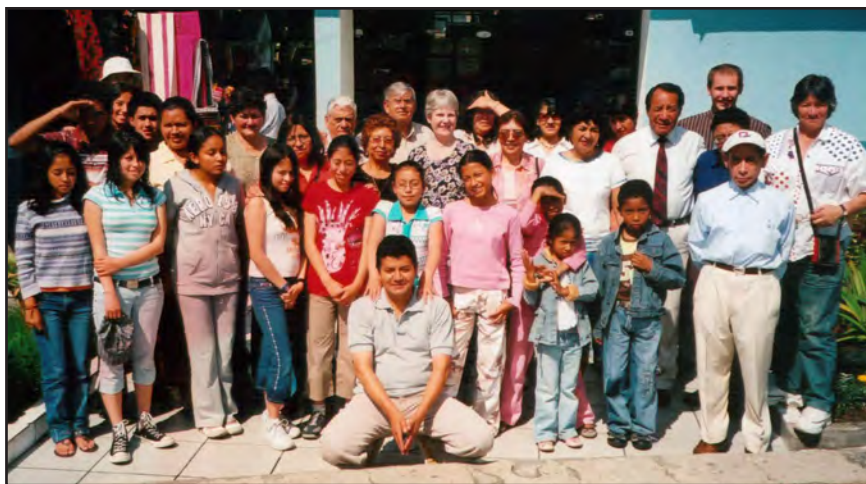
Attendees of the second annual Convivencia

The ecclesia in Quito, Ecuador, enjoyed its second annual “Convivencia” (Bible Camp) for four days, from Saturday, February 21, to Tuesday, February 24, 2009. The ecclesia took advantage of a national country holiday “Carnaval”, when most of the members and regular visitors at ecclesial meetings could attend. Saturday morning about 9 a.m. a large bus picked up a number of members and their families, as well as friends at the ecclesial hall in Quito and started on a journey of more than three hours, picking up others along the way. The Bible Camp was held in Ambuqui at an inn which is at a lower elevation than Quito, so it was warmer, yet dry. The facility has clean rooms, good food and a very adequate meeting room, plus a decent outdoor pool.