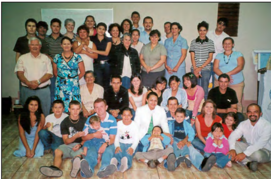
Members of the Costa Rican Ecclesia, CYC and children.