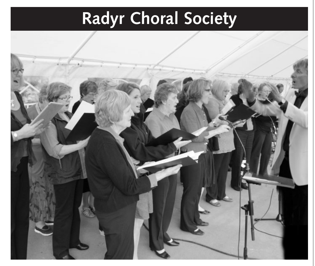
Members of the new Radyr Choral Society during their performance at the recent May Festival