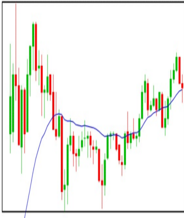
Chart 2: Range, Bloody