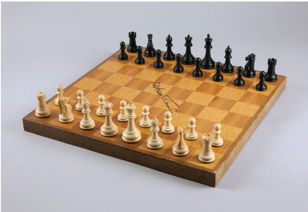
TOP: Chess board signed by Bobby Fischer and Boris Spassky, 1972. Chess Pieces from Game 3 of the 1972 World Chess Championship, 1972.