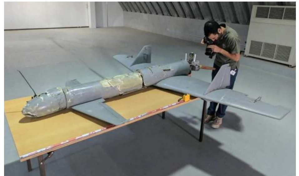
A Houthi Qasef-1 model drone, as used against Aramco target in Jazan (screengrab) Middle East Eye 4-11-18