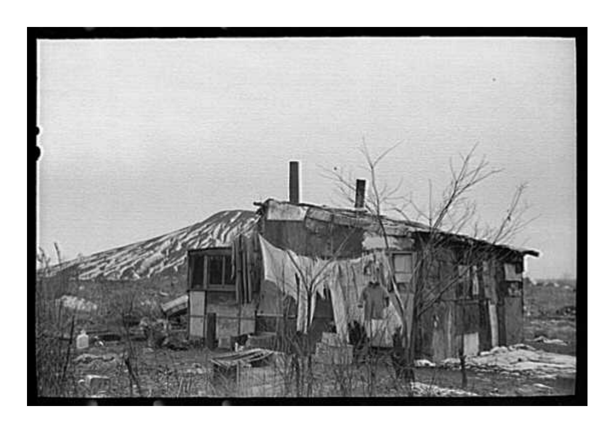
Answer the following questions in complete sentences. What are the circumstances represented by this photo?

Describe the condition of the house in the photo.