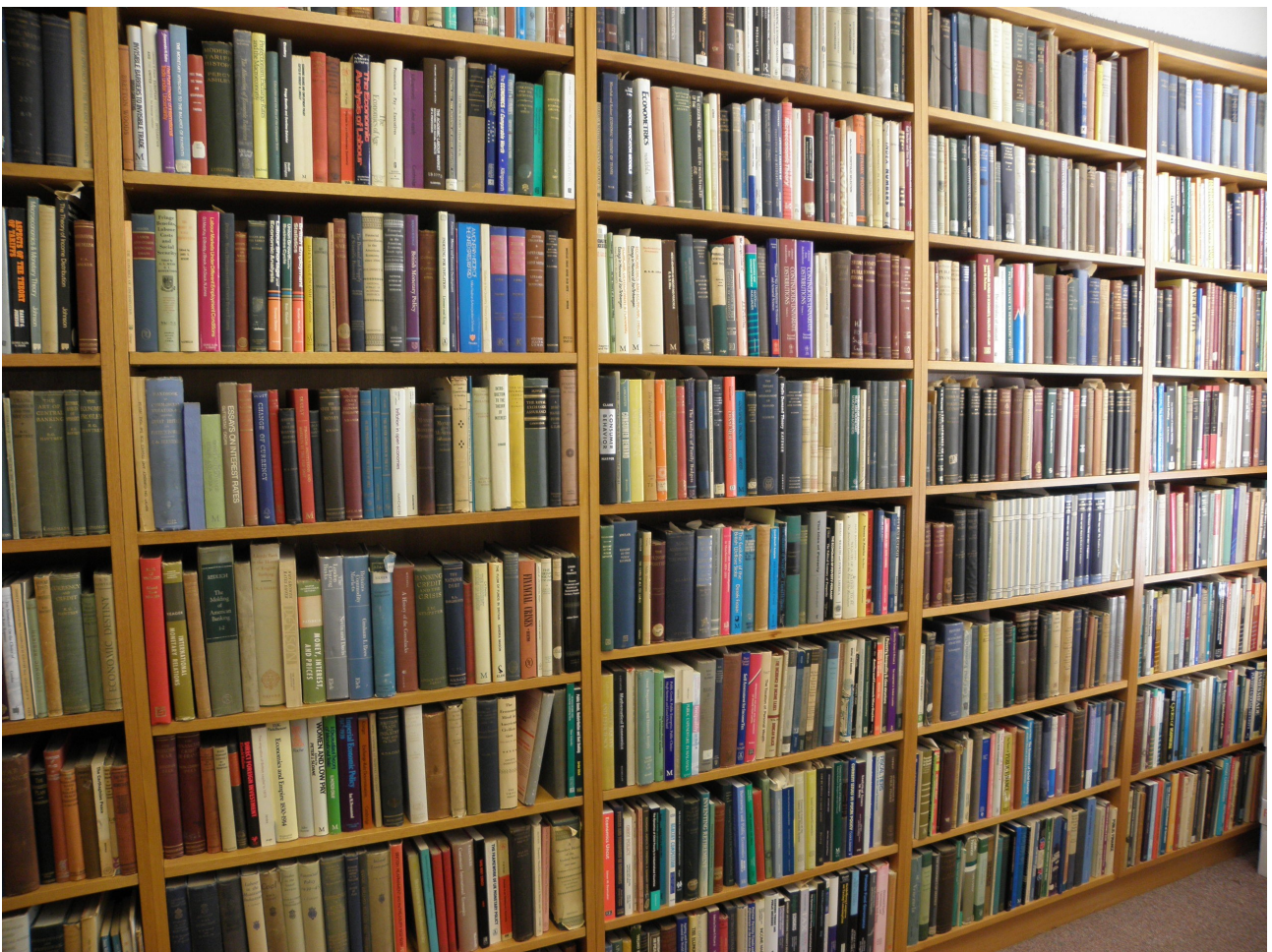
Part of the Creedy Collection of Important Economics Books