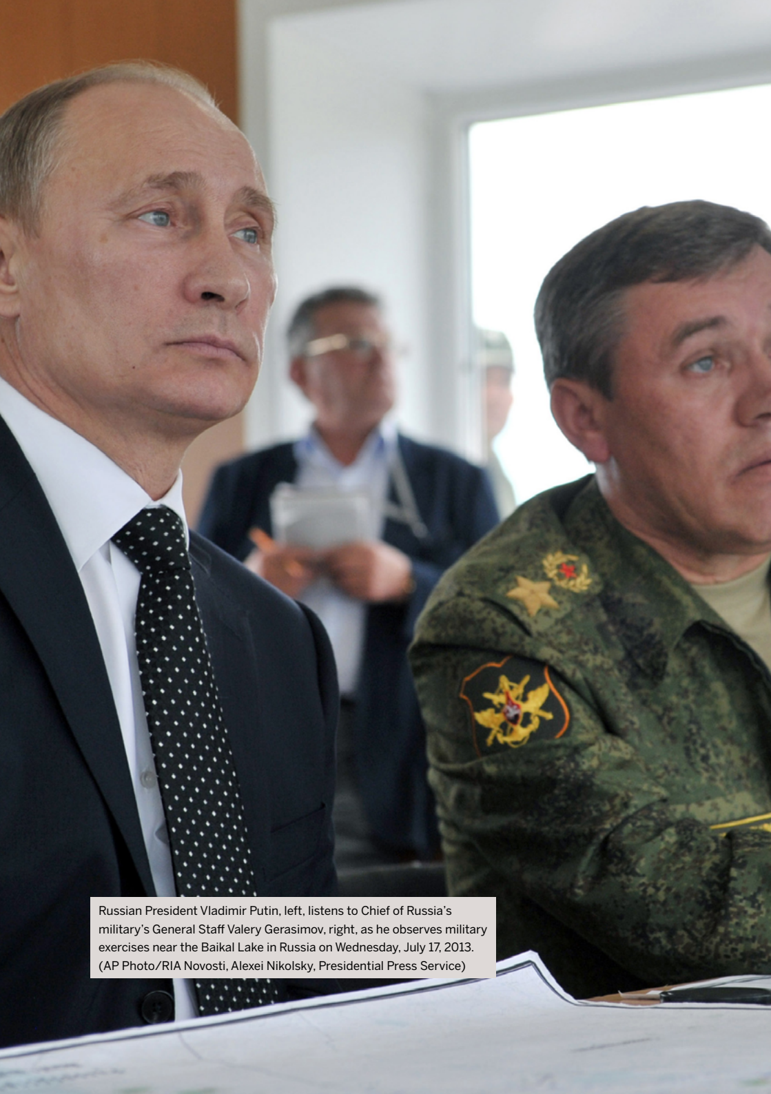
Russian President Vladimir Putin, left, listens to Chief of Russia's military's General Staff Valery Gerasimov, right, as he observes military exercises near the Baikal Lake in Russia on Wednesday, July 17, 2013.