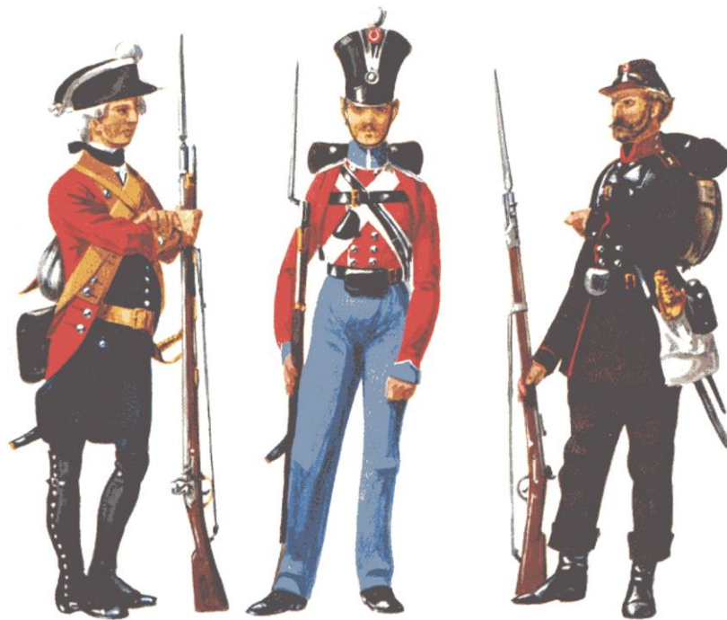
Fig. 1, 1763