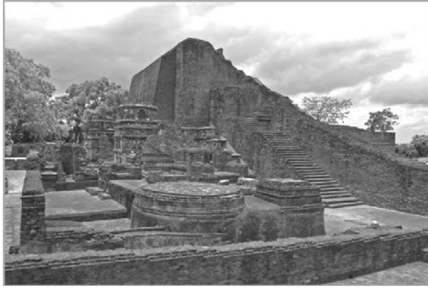
Figure 3.1 The Stūpa of Śāriputta

The report in the Anupada-sutta that Śāriputta determined the mental states of each absorption one by one endows the Abhidharma approach to analysis with the prestigious authority of having been the actual form of meditation practice undertaken by the disciple whom the early tradition reckoned as outstanding for his wisdom. 44