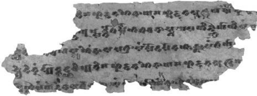
Figure 1.2 Saṅgīti-sūtra Fragment

Similar statements can be found in the Theravāda Dīgha-nikāya and Dharmaguptaka Dīrgha-āgama versions of the Saṅgīti-sūtra . 55 The formulation highlights a predicament that must have been acutely felt in an oral setting once a teacher had passed away: how to determine what he taught, if there are no written records? The need to arrive at an oral consensus on what the teacher had taught is precisely what informs the purpose of the Saṅgīti-sūtra .