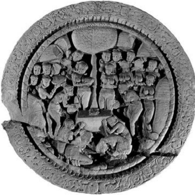
Figure 4.1 Sujātā's Offering

The medallion shows Sujātā offering food to the bodhisattva Gautama, represented by his seat under the tree of awakening.