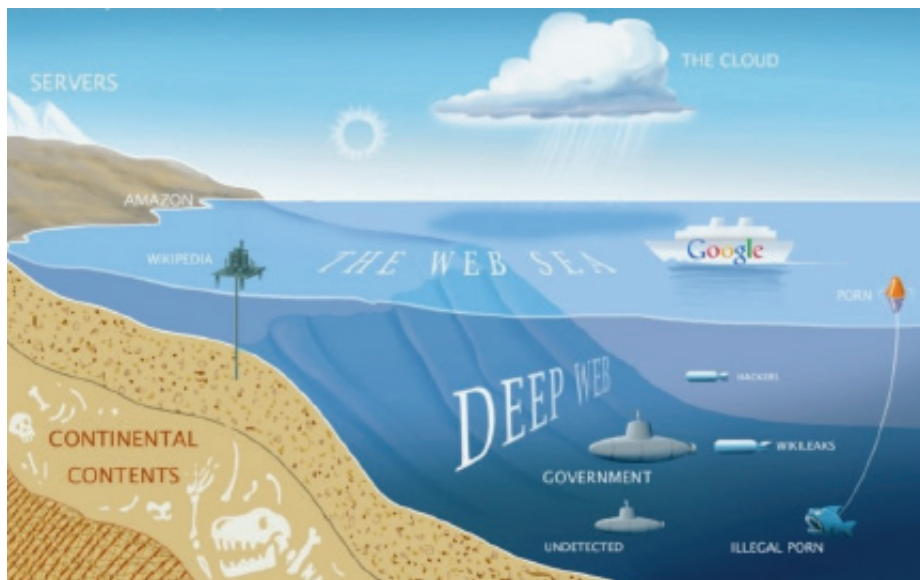
FIGURE 1. The Surface Web vs. the Deep Web