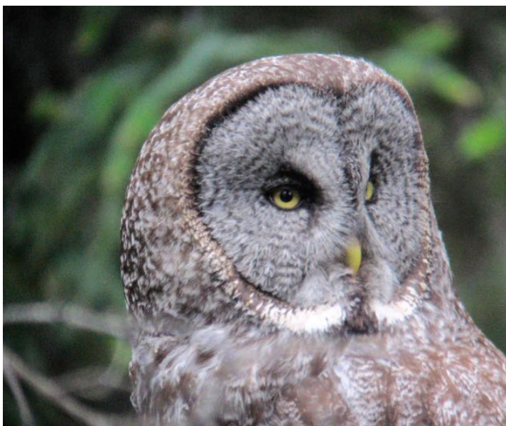
Great Grey Owl