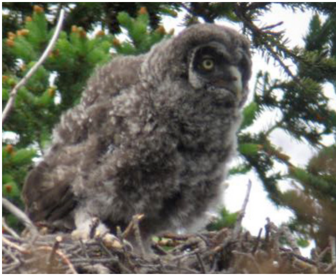
Great Grey Owlet