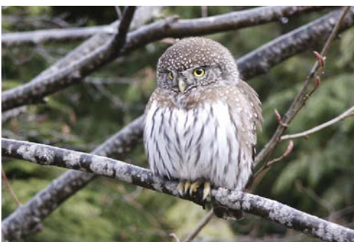
Northern Pygmy Owl (open source photo)

On the way back to the cars we contemplated the winter constellation Taurus charging into Orion.