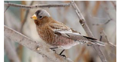
Gray-crowned Rosy-Finch (Interior race)