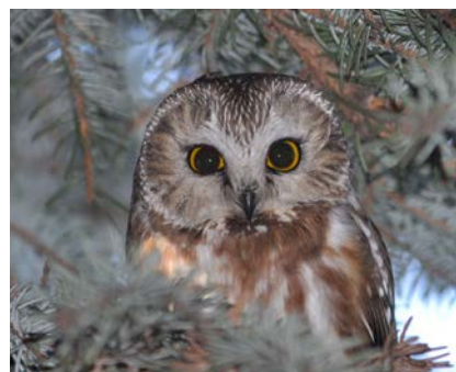
Saw-whet Owl