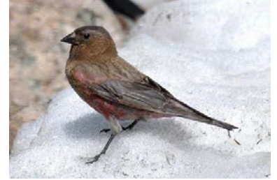
Brown-capped Rosy-Finch

The real pinnacle of the day was getting to see our target birds for the trip, the Rosy-Finches - roughly two hundred of them. Swirling around in clouds of a hundred birds at a time they would drape the tops of the nearby spruces, and then descend en masse onto the feeders. Needless to say, the good views were PLENTIFUL, and we were able to record both sub-species of Gray-crowned Rosy-Finch as well as the more plentiful Brown-capped Rosy Finches. The fact that there were adult-males, first-year males, and many females contributed to an intriguing amount of plumage variation. Search, as we could, we were unable to locate any of the more rare Black Rosy-Finches. All in all, a most satisfactory outing!