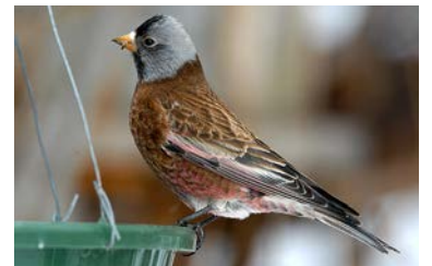
Gray-crowned Rosy-Finch (Hepburn's race)