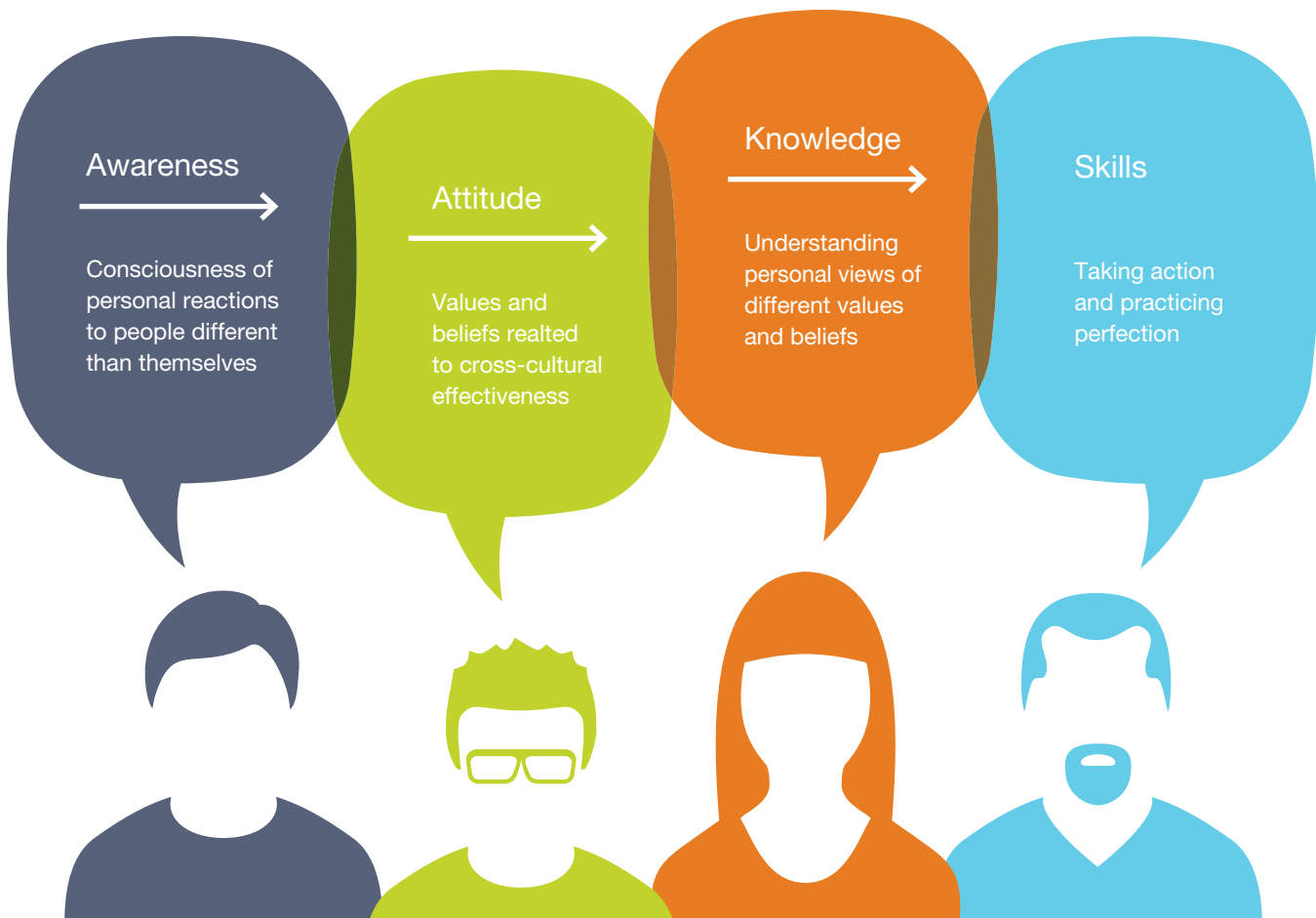
Figure 2 The flow of effective action 18

The Diversity Training University International (DTUI), a leader in the field of diversity certification and training, specializes in training, instructional design, organizational development and methodology of cultural competency components. DTUI isolated four components that are utilized to measure cultural competency: Awareness, Attitude, Knowledge and Skills (Figure 2).