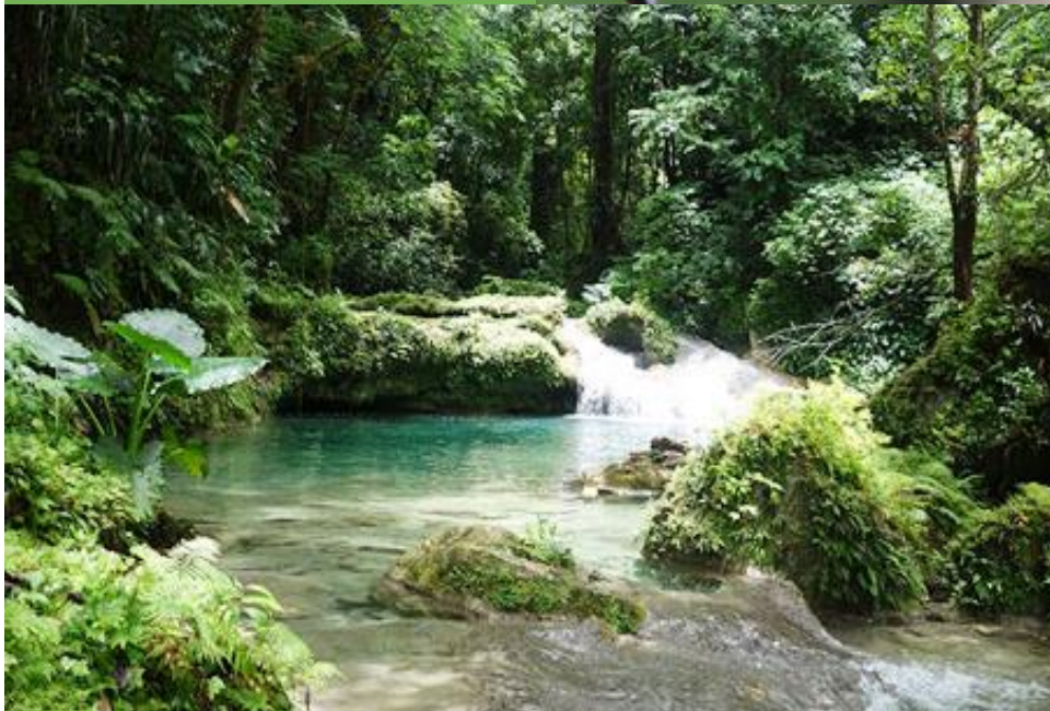
Photo of the week Reach Falls