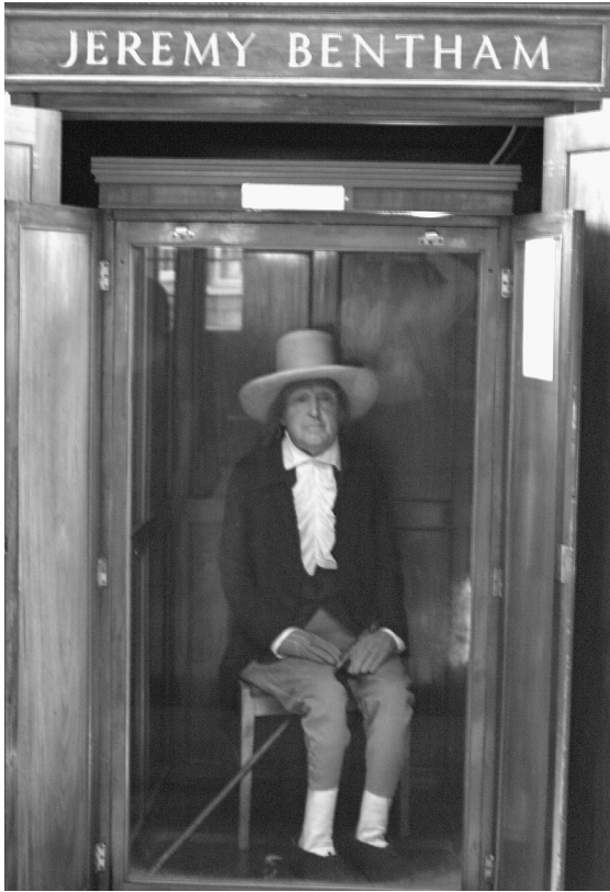
▲ Photo 3.2 Jeremy Bentham, often credited as the founder of University College London, insisted that his body be put upon display there after his death. You can visit a replica of it today.

principle of utility, which prescribed “the greatest happiness for the greatest number.” The principle posits that any human action at all should be judged moral or immoral by its effect on the happiness of the community. Thus, the proper function of the legislature is to promulgate laws aimed at maximizing the pleasure and minimizing the pain of the largest number in society—“the greatest good for the greatest number.” 24 Having its basis in the natural human need for happiness, the principle of utility can be seen as a principle of natural law.