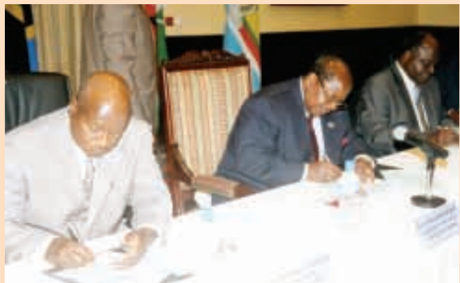
East African Community presidents signing the protocol from left President Y.K. Museveni (Uganda), B.Mkapa (Tanzania) and Mwai-Kibaki ( Kenya)

In the theory of economic integration, a Customs Union is supposed to be the third stage of integration. The first stage is the Preferential Trade Area and the second stage is the Free-Trade Area. The rationale for these two stages is to prepare states for a more complex level of integration- the Customs Union. However, the treaty establishing the E. African community skipped the first two stages of integration. Therefore, the Customs Union constitutes the first stage of integration under the East African Community 21 .