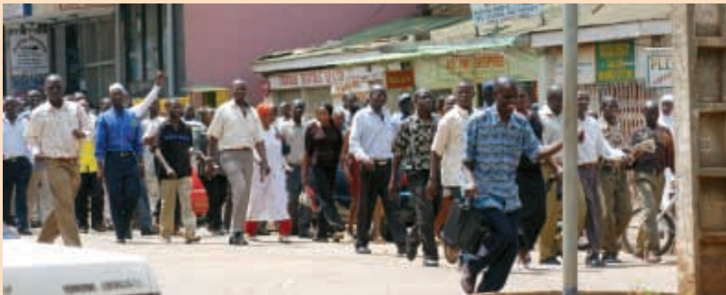
Kampala Traders on strike protesting increased taxes. Such strikes could have been averted if traders appreciated the short term impact of the E.African Customs Union.

It is important to note however, that the coming into force of the Customs Union produced highly negative reaction. In Kampala, traders were involved in several strikes. Consultations with the majority of the traders revealed ignorance of the outcomes of the negotiations casting doubt on the effectiveness of the consultations.